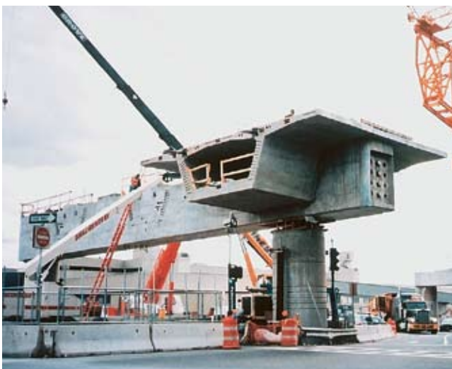
Fig. 9. Straddle bent with precast segments.

Construction is taking place as existing traffic is maintained, and precast segmental concrete construction has proven to be versatile and adaptable for use in complex urban interchanges.