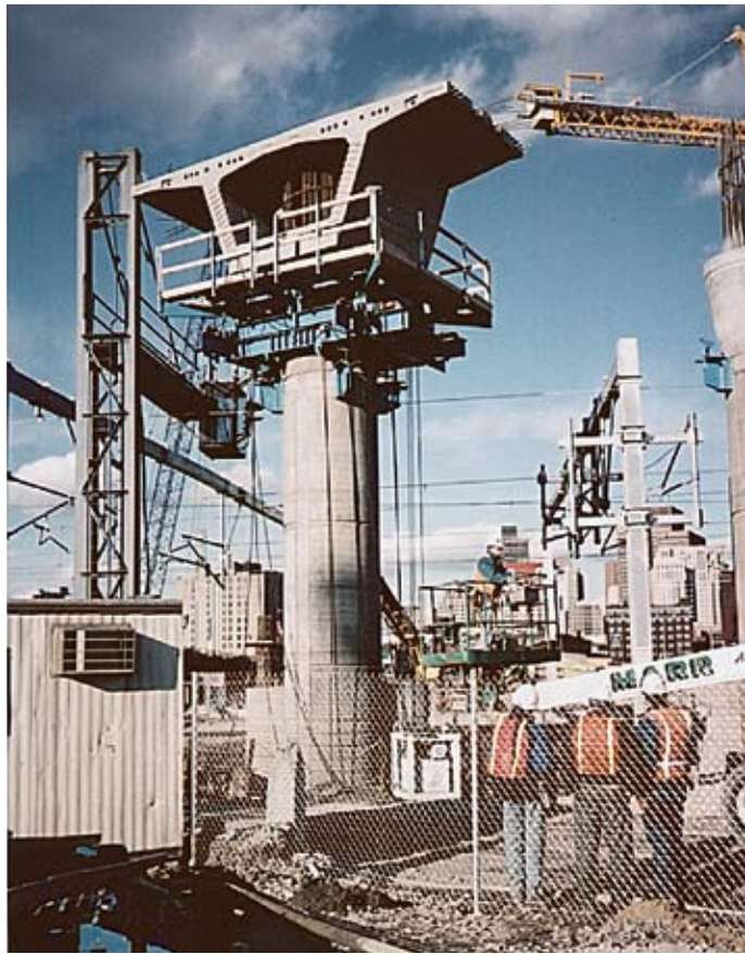
Fig. 8. Precast fixed bent segment in place.