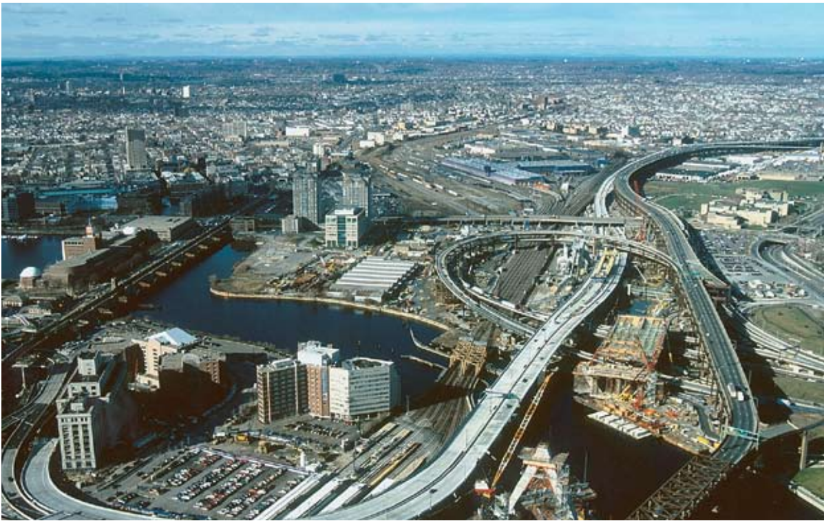
Fig. 1. I-93/Route 1 Interchange.

At project inception, three basic types of precast concrete segments (see Fig. 3) were standardized for this undertaking: