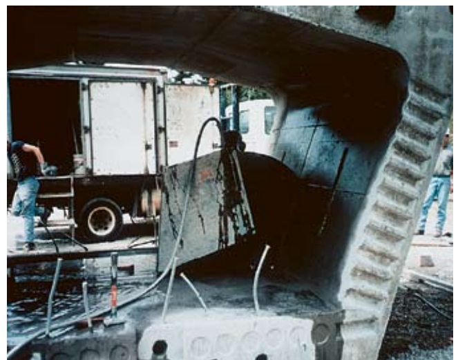
Fig. 10. Saw cutting of segment.