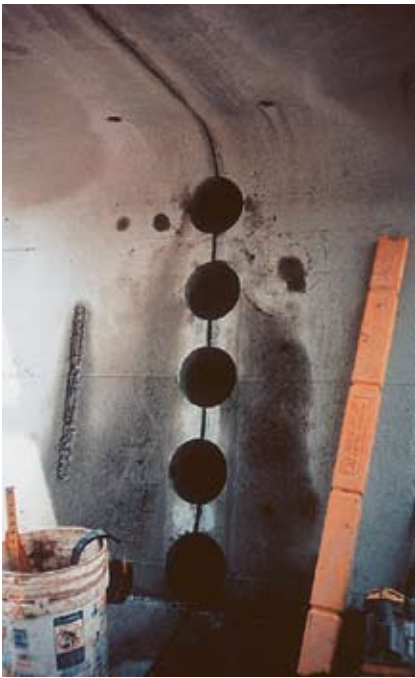
Fig. 11. Coring of shear keys.

Variable width main line roadway cross sections with numerous intersecting ramps have been smoothly integrated to provide highly functional and aesthetically pleasing structures.