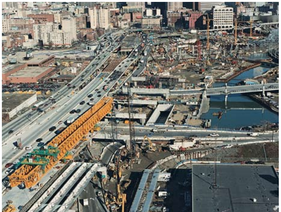
Fig. 2. I-93/I-90 South Bay Interchange.

The interchange, the junction of I-93 and I-90, is located to the south of downtown Boston. The new inter-