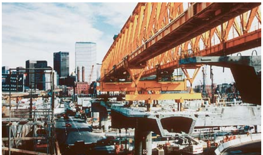
Fig. 5. Self-launching overhead gantry.

In the span-by-span erection method, all segments of a span are aligned and supported by the gantry. As each segment is erected, epoxy adhesive is applied to the segment face and temporary 1.375 in. (36 mm) diameter post-tensioning thread bars connect it to the previously erected segment.