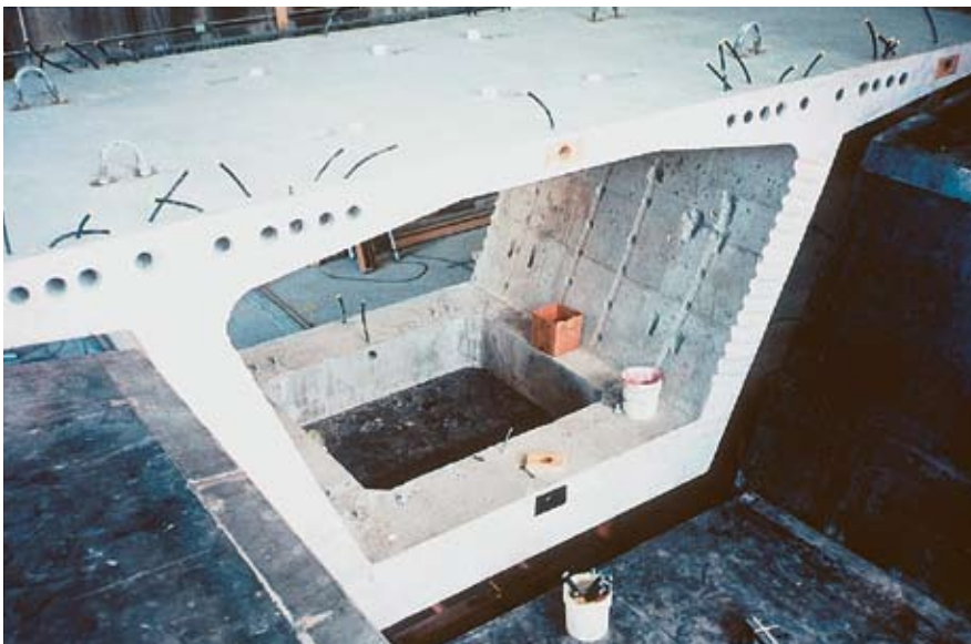
Fig. 6. Precast fixed bent segment.

Typically, the alignment of the superstructure is skewed to the straddle bent which makes forming difficult. To improve construction, the cast-in-place extensions have been replaced with skewed precast starter segments. Shear keys are cast into the face of the straddle bent to provide for shear