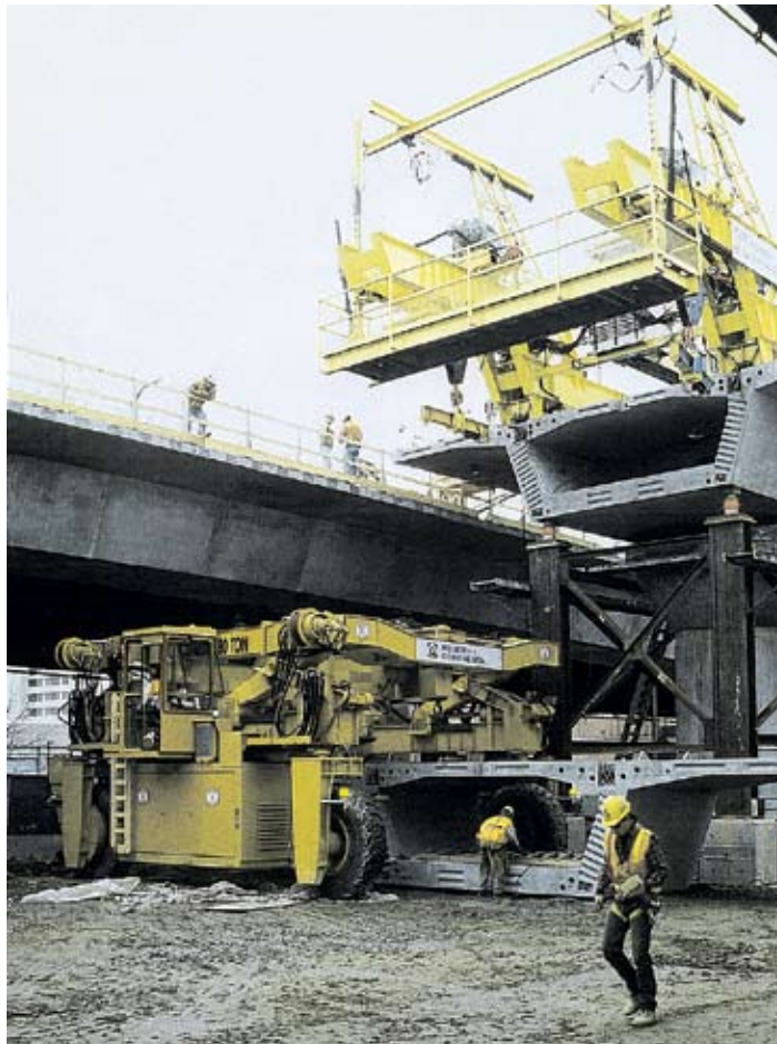
Fig. 4. Self-launching erection device.

The new I-93/Route 1 Interchange is located west of the existing I-93 align-