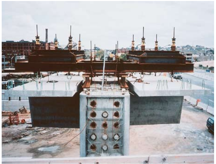
Fig. 12. Precast segment supported at straddle bent.

Owner: Massachusetts Turnpike Authority, Boston, Massachusetts Managing Consultant: Bechtel/Parsons Brinckerhoff, New York, New