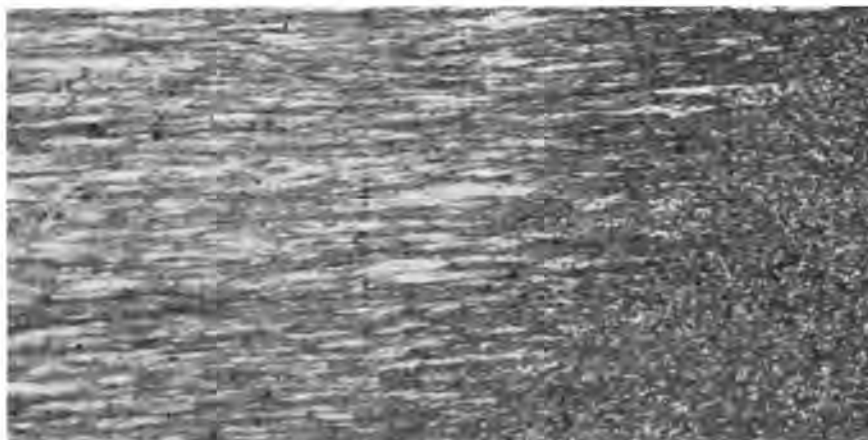
Fig. 1. Photomicrograph taken at 150X magnification. Note the transition from fibrous cold drawn structure on the left to granular heat affected structure on the right.

to sustain heat damage and, in many cases, the damage is not visible to the unaided eye after the wire has cooled.