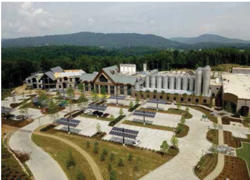
Aerial view of brewhouse, including production and packaging facilities.