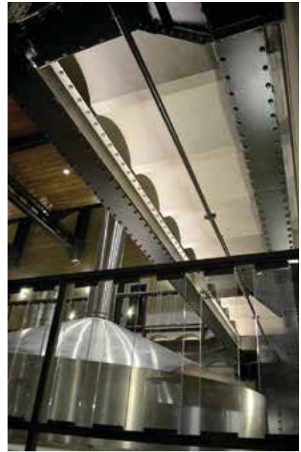
Scalloped precast ceiling in brewhouse.