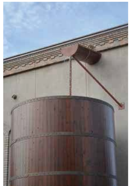
Architectural precast walls and rainwater collection outside warehouse.

requirements. Other precast pieces included bulb tees, double tees, beams, columns, floor slabs, insulated floor slabs, and spandrel panels.