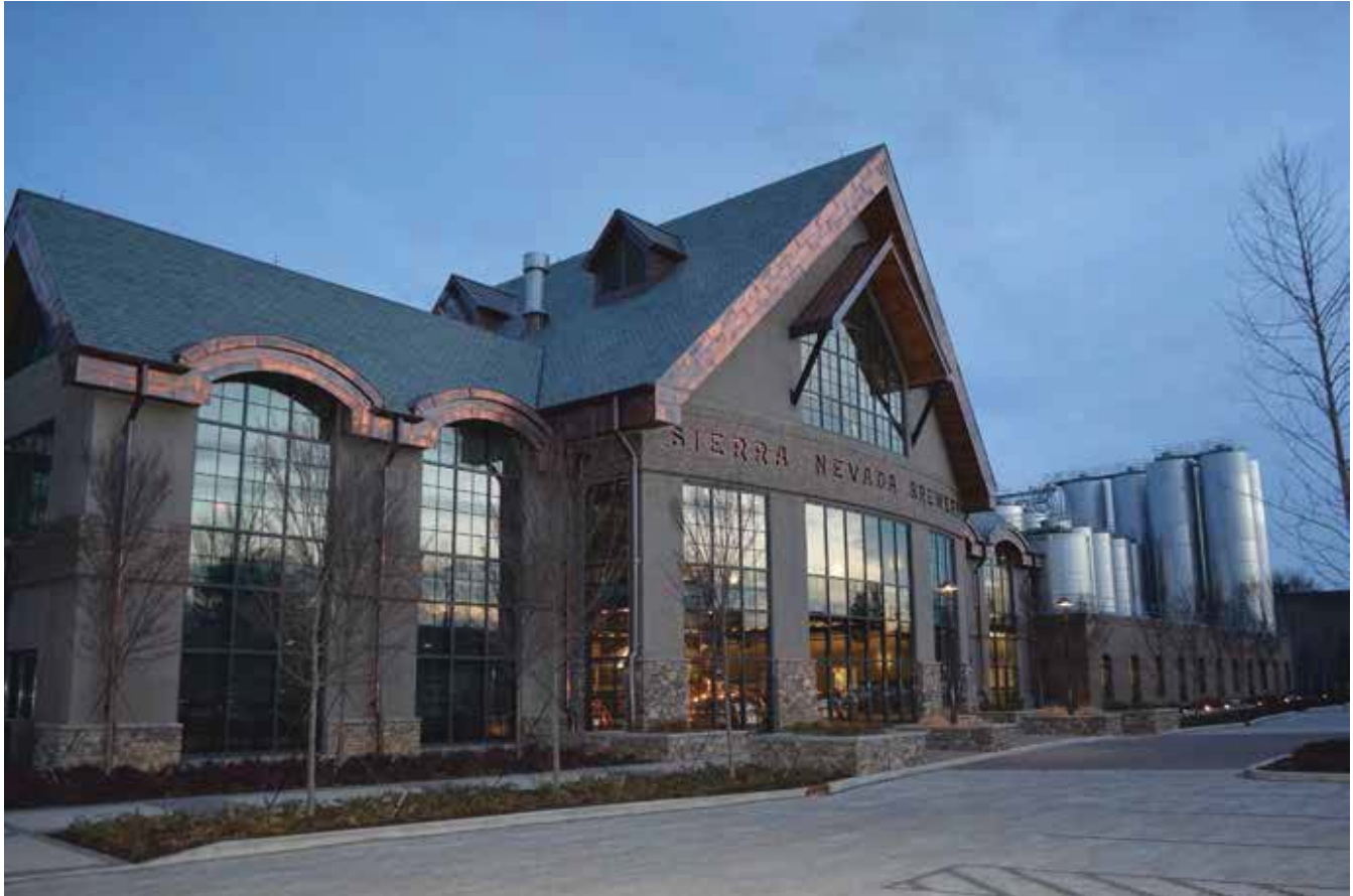
Exterior of Sierra Nevada brewhouse entrance, Mills River, N.C.

In 2012, Sierra Nevada Brewing Company announced plans to build a second brewery in Mills River, N.C. The goal? To increase the company's brewing capacity and deliver more craft beer to more people. Expectations for the new brewery were high, and the project ultimately was faced with bad weather and tight deadlines. However, these challenges proved to be no problem for the experts at Tindall Corporation, a trusted leader in the precast industry.