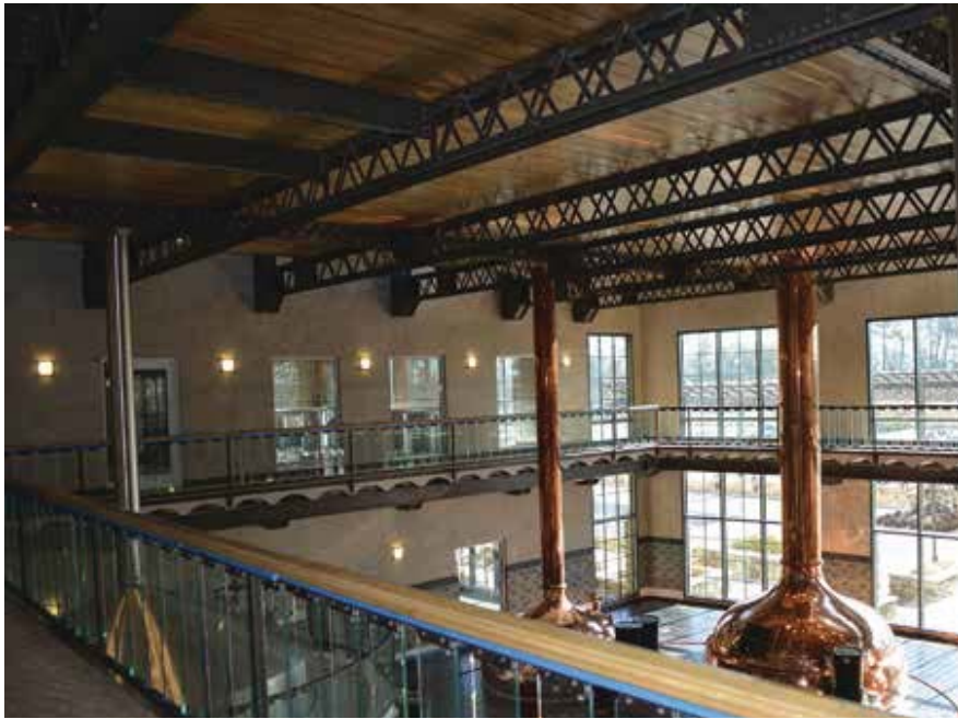
Interior of brewhouse.