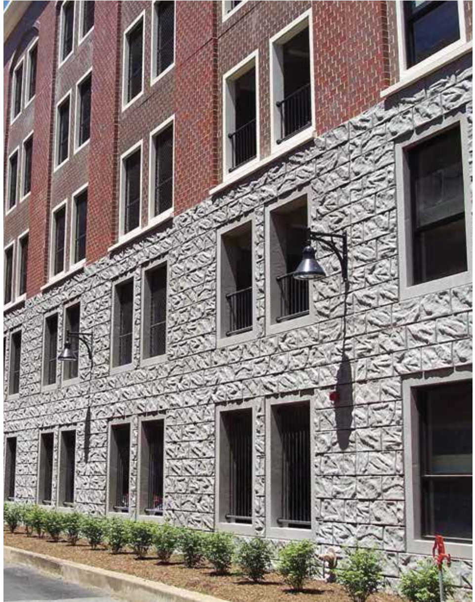
Figure 3 Chiseled limestone base for George Washington Auto Park, Winchester, Va.

The seven tier parking structure, Fig. 3 , is located within a historical district where limestone and brick masonry are prevalent. The structure's chiseled grey limestone base ascends two tiers. Custom formliners were rotated to provide variations more characteristic of limestone. A deep relief was used in the joints to provide shadows that break up the uniformity within the precast.