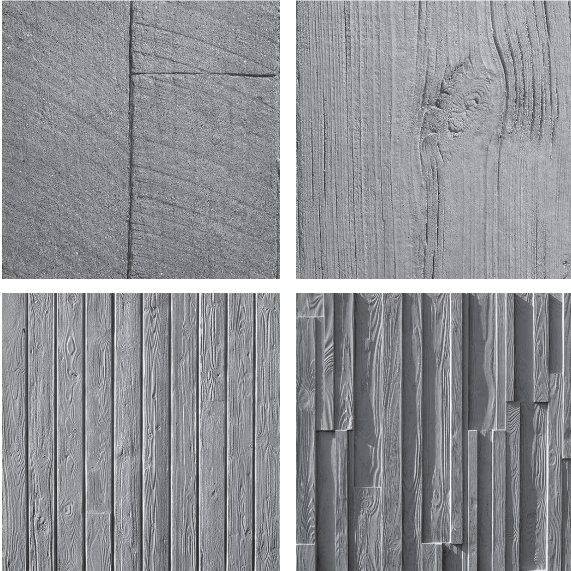
Figure 4 Some of the available wood textures.

Many types of wood textures such as weathered wood boards, split cedar shakes, and hand hewn woods can be emulated with formliners, Fig. 4 . Sealed sandblasted wood, textured plywood, and rough-sawn lumber are useful in creating rugged textures. (Resultant surface texture may also be obtained by use of other liners reproducing this finish.) Rough-sawn lumber is used for board-surface textured finishes where concrete color variations and rough edges are acceptable.