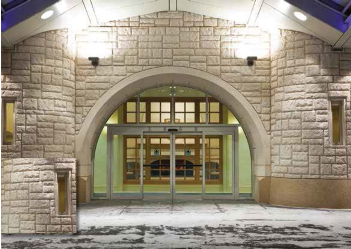
Figure 2 Rock-faced units on Sanford Children's Hospital, Sioux Falls, S. Dak.

If preformed or stock formliners are selected, it is good practice to describe the pattern and to include a reference to the pattern and its manufacturer specification. The formliner, or the effect or texture may be specified in the contract documents. Fig. 1 shows some of the countless available formliner patterns from liner manufacturers.