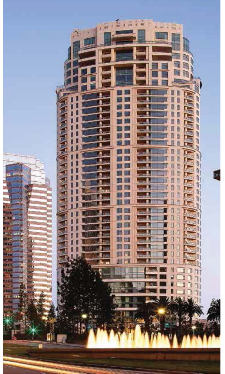
Architectural precast concrete panels clad The Century, a 42-story residential tower in Los Angeles, Calif. Designers wanted to project a contemporary yet classic appearance that combined modern touches with sustainable design.