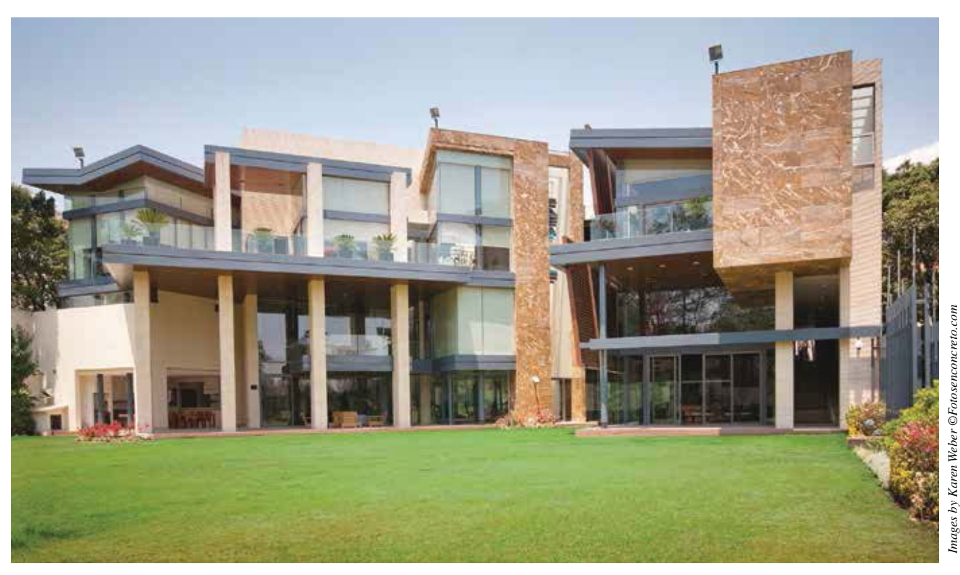
This 107,640-square-foot, single-family residence in Huixquilucan, Estado de Mexico in Mexico used architectural precast concrete panels to create a personalized look that continues inside with additional precast panels.