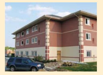
Eighty-four-unit assisted living facility built to withstand an F-4 tornado.