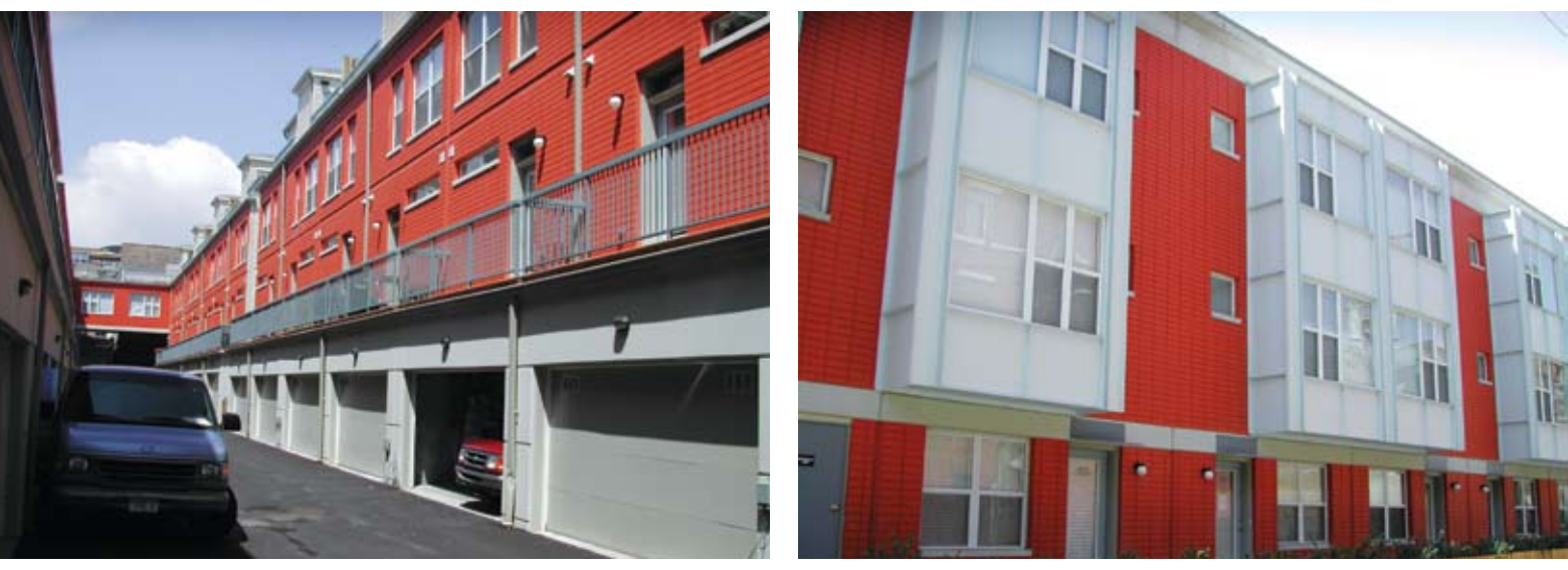
Arcadia Place in Chicago, designed by Landon/Bone/Baker Architects and developed by Dubin Residential, features stacked-bond patterned precast concrete wall panels, smooth panels with reveals, garage headers and precast concrete parapets provided by Prestress Engineering Corp. in Prairie Grove, Ill.

Building new homes with precast concrete hollow-core roofs would add more benefits.