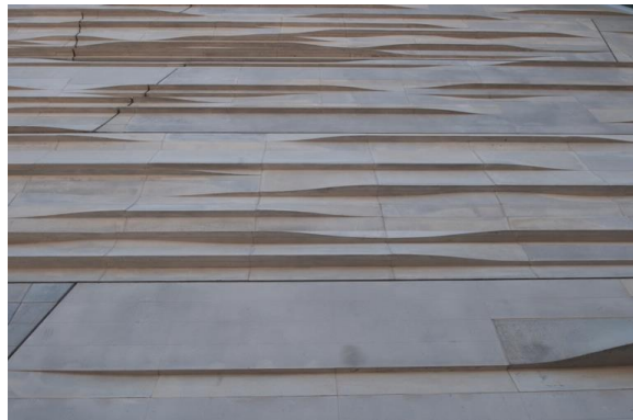
Fig. 1 Exterior wall detail (looking upwards) of the Perot Museum of Nature and Science in Texas located in the Dallas West End

I also include a lecture that features images of “cutting-edge” design projects that are very important for architecture students in their understanding of how the industry is evolving and where it might be going next. This year the lecture featured the “Perot Museum of Nature and Science in Texas” by Pritzker Architecture Prize Laureate Thom Mayne and his firm, Morphosis with Good Fulton + Farrell as Architect of Record. This building is impressive in its sustainable performance ratings as well as being an exquisite precast archetype. Many architecture students find this cutting edge precast design to be very interesting. They see it as validation of their own creative studio work. They are impressed with the sustainable nature of this museum and that it has secured the highest possible Green Globes rating from the Green Building Initiative. The case study is presented by a graduate student to reveal the architect's design concept which was inspired by a geological sedimentary stratum that is smoother and casts less shadow as the eye progresses upwards to the top of the building.