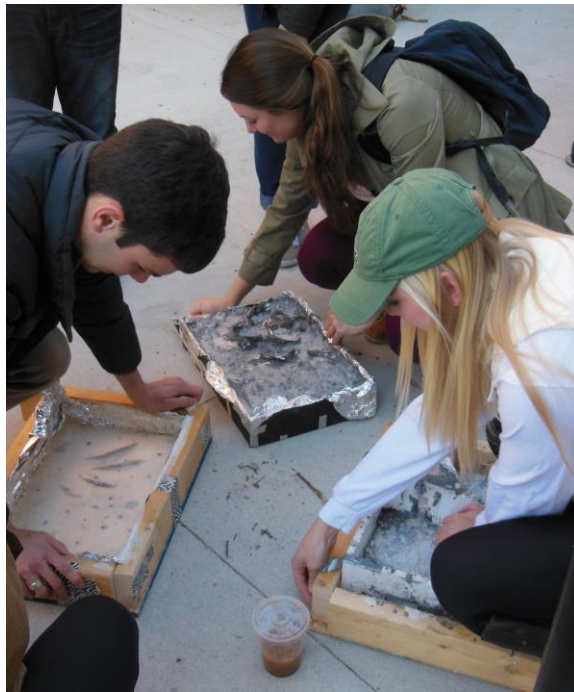
Fig. 6 “Stripping Party” at University loading dock adjacent to the dumpster.

A week later, the collection of weird forms are delivered to the university by the precast plant for the much anticipated “Stripping Party”. Students are anxious to strip out their masterpieces. Again no shortage of volunteers from the plant comes along to see what hatches out of the forms. The stripping occurs near the dumpster, as a matter of convenience or lack of confidence. This facilitates the clean up. Regardless of my intent, some of the best results are fantastic discoveries. Some are structural failures that become post-mortem discussions before the project is interred in the dumpster or reduced to colorful aggregate with a sledgehammer. All students give opinions when a project breaks during the stripping operation.