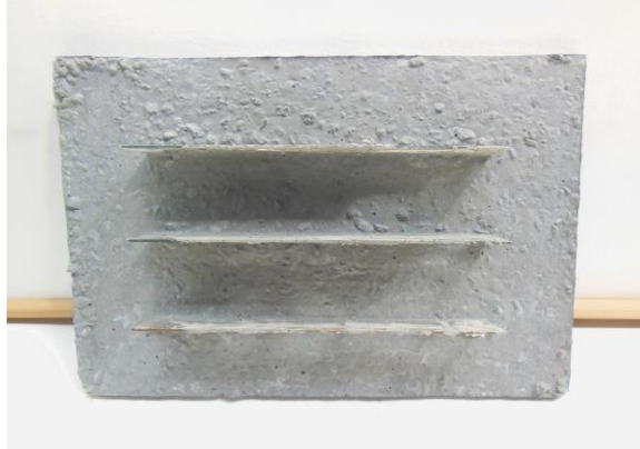
Fig. 25 Glass shelves contrast the mass of the concrete panel