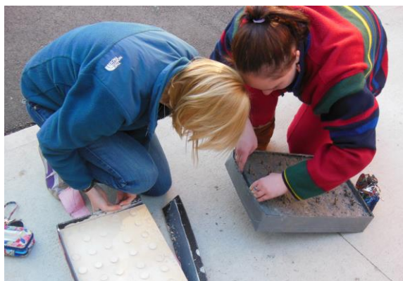
Fig.5 Stripping formwork is not as easy as it looks.

The architectural precast concrete “bartender” dispenses advice and mixes small quantities of white cement ready for the student’s request of a specific color. He helps each student mix the preferred color and quantity of cement dye from his shelves. The exotic cement dyes are catalogued and stored on shelves and were noted by students to be reminiscent of bottles of liquor, hence, he is known as the “bartender”.