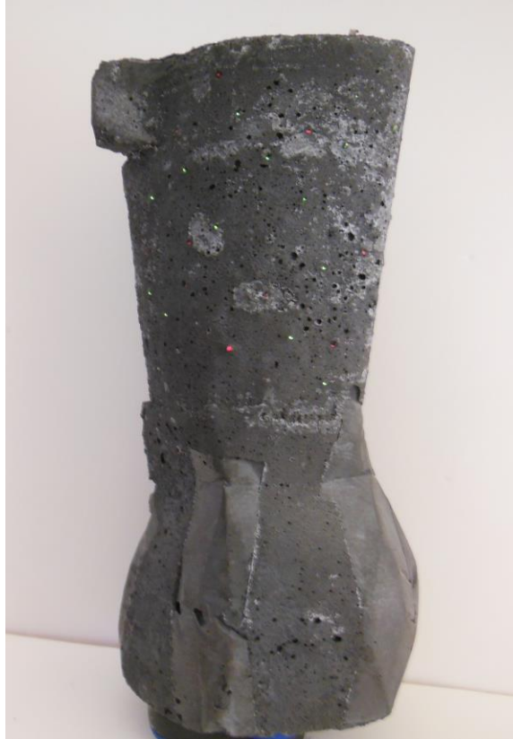
Fig. 21 Contrasting textures were created with Styrofoam forming the upper portion and a duct tape liner at the bottom. Glowing red and green fiber optic whiskers penetrate the skin from the hollow interior.