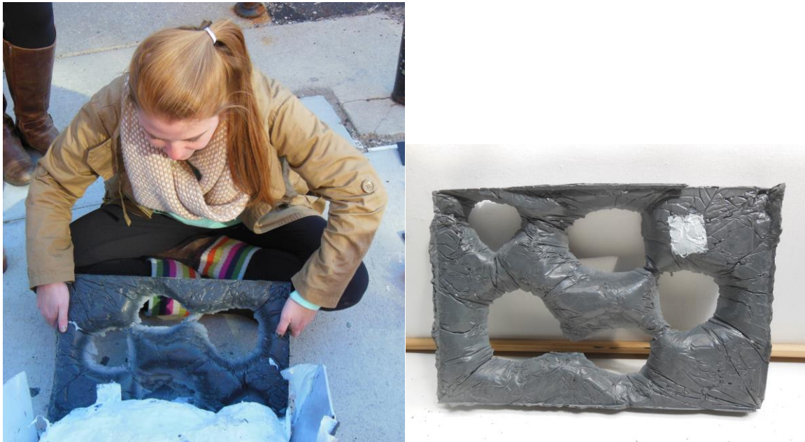
Fig. 9+10 The creation of voids through a wall panel for view and light transmission. The texture is created by the folds in the thin plastic sheeting.