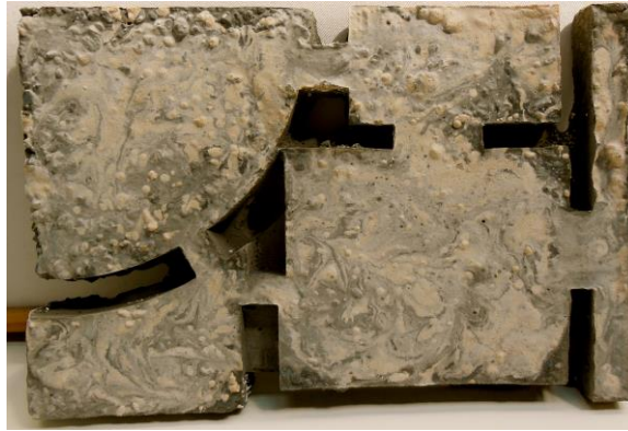
Fig. 24 Geometric voids in a modular panel which when reversed and stacked create a larger module of 4 panels