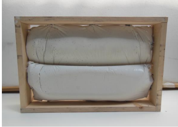
Fig. 26 The formwork remains to frame the soft shape of fabric formed concrete pillows