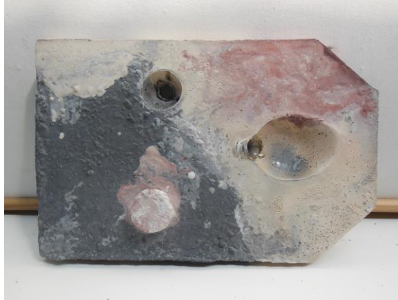
Fig. 27 Plastic bottles inserted through formwork directs light without providing a view through the panel