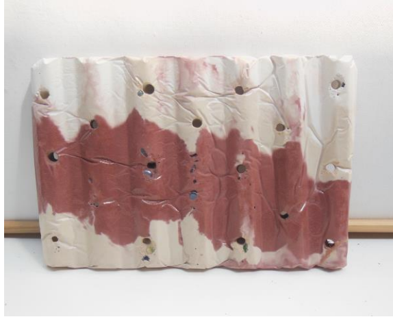
Fig. 11 A corrugated form liner was used with uniformly spaced grid of penetrations.