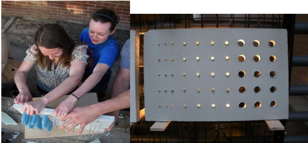
Fig. 16+17 Stripping formwork is a hands-on experience that can prove to be more difficult than anticipated.