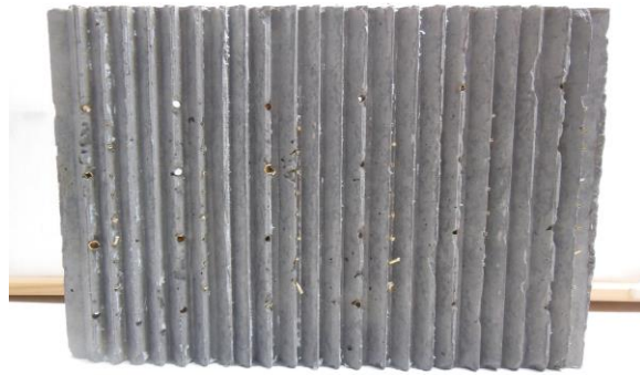
Fig. 12 The holes in this panel were self-stripping.