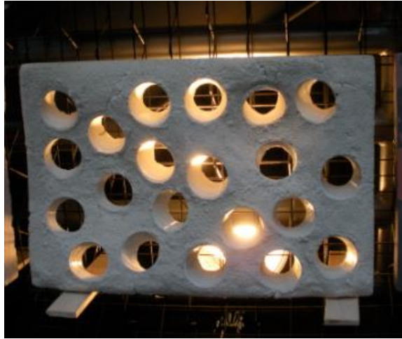
Fig. 15 Panel was contour formed in a sand bed with embedded plastic cups, which can be popped out and reused.