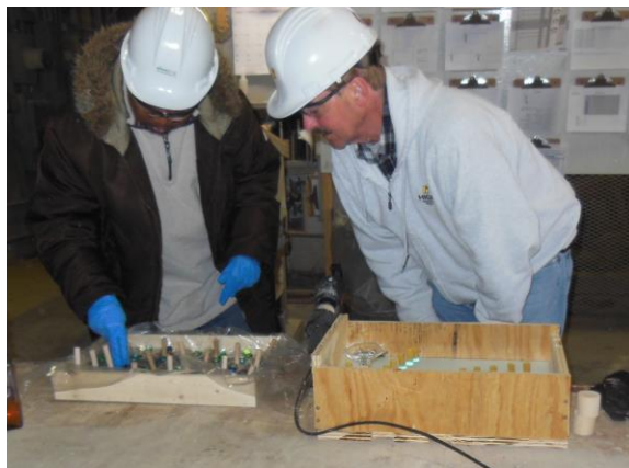
Fig. 3 Precast foreman suggesting additional reinforcement for student's formwork prior to casting.

My requirements are to examine and understand the rules, and then bend the limits one at a time. Bending or twisting the rules is the preferred method in which to find and stretch the boundary limits. I feel that if students can experiment with concrete in unusual ways that are more in keeping with the ways they approach design and problem solving. In this way, concrete can transcend it's common reputation in the eye of the public, that thinks "cement buildings," as they call them, are grey and uninspired.