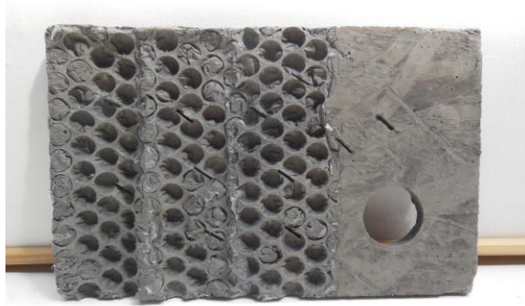
Fig. 28 Repeating a form insert component that has some voids partially filled