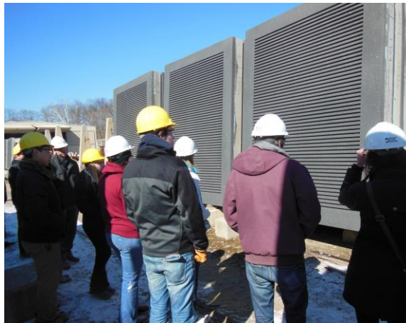
Fig. 2 Miami University architecture students touring local precast plant

The coordination of forming and stripping start to be comprehended and appreciated in the noisy, aggressive environment of the concrete plant that students find to be complex, intimidating and interesting. They are intrigued with the seemingly endless palette of materials, finishes and textures. They respect the skill and craftsmanship of the professionals at the precast plant. Even those students, who don't fully appreciate the necessary timing and coordination of the precast plant operation, finding it chaotic, start to appreciate their own privileged situation as a college student. They are amazed at the complexity of the operation and the coordination necessary to cycle a plant in 24 hours.