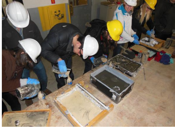
Fig. 4 Students at the precast plant with custom dye (color) mix