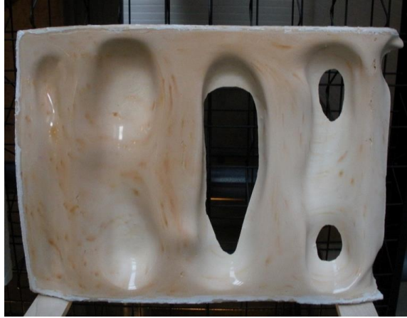
Fig.8 A slick finish pastel panel illustrating a variable thickness from 2" to 0" The edges around the voids are paper-thin.