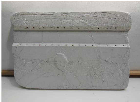
Fig. 20 fiber optic whiskers with LED light source