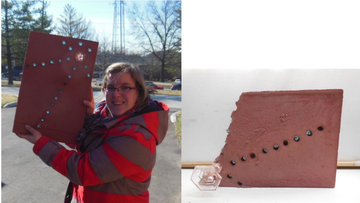
Fig.22+23 Panel immediately after removal from form. It collapsed during transport, minutes later.