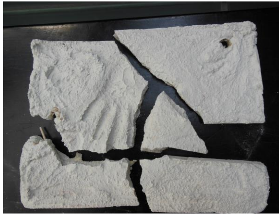
Fig.7 Approximately a 1/4 of the students encounter problems during the stripping process. These are unceremoniously delivered to the dumpster.

others were able to achieve success. If students can gain hands-on experience, concrete will educate them as they wrestle to train and contain this amazing material that has humbled most of us.