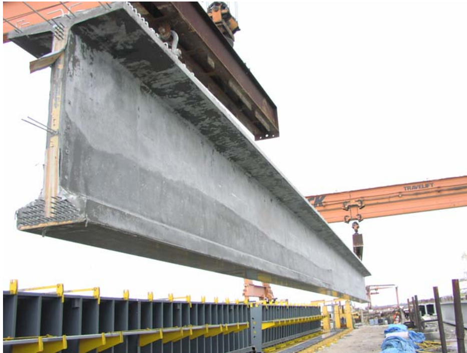
Figure 3. Lifting 145 foot long by 95.5 inch deep PCEF Bulb-T.

The basic strut-and-tie model developed for Bulb-T beams is shown in Figure 4. Note that there are actually two strut-and-tie models that will be solved separately. The upper strut and smeared tie model is solved to design a total bar area and distribution to control the diagonal cracks in the web. The bars are assumed to be evenly spaced along a length equal to about 75 percent of the beam height. This ignores the fact that the bar density will actually be increased near the beam end. These vertical bars are all assumed to act at a uniform stress level chosen by the engineer.