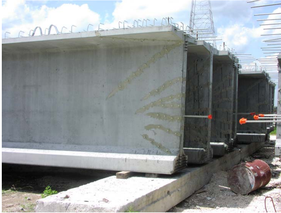
Figure 1. 95.5inch PCEF Bulb-T beams with crack repairs.

lengths. The fourth is that the force from the beam self-weight should not be included in the analysis. All of the beam end cracks were noted to have formed or to have extended when the beams were lifted off of the soffit forms. Note the location of the lift devices in Figure 2 and Figure 3.