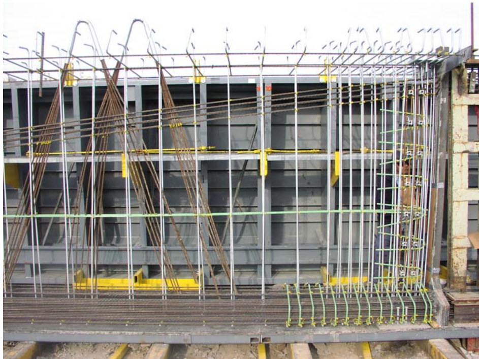
Figure 2. Reinforcement distribution near beam end.