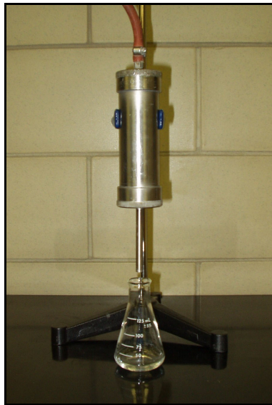
Figure 2: Schupack Pressure Filter.

The test specimens, as shown in Fig.3, consisted of a length of seven-wire prestressing strand placed in a 100 mL graduated cylinder containing 50 mL of bleed water. The strand surface was cleaned with acetone and the strands were weighed beforehand. All strands were taken from the same spool for consistency between specimens. The specimens were covered and sealed in an attempt to prevent evaporation and simulate the environment inside of a sealed post-tensioning duct. The strands were exposed to the bleed water in the sealed system for a period of six months.