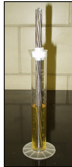
Figure 3: Test Specimen.