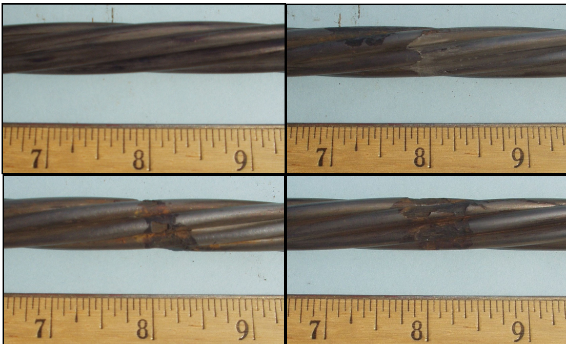
Figure 4: Details of (clockwise from top left) strands with no corrosion, light surface corrosion, and heavy pitting corrosion (2).

The cement type used in the grout mixtures did not noticeably affect the grout properties or the corrosive characteristics of the extracted bleed water. Bleed water from grouts dosed with the same admixture and different cements displayed similar corrosive characteristics. The corrosion caused by the bleed water from these grouts was comparable in nature and severity. The observed corrosion products and progress were also very much alike. Combinations of common grouting admixtures are often used in particular mix designs. In two cases (IX-I and OX-II), the combination of a corrosion inhibitor and an expansive admixture resulted in a grout with bleed water that was more corrosive than mixes containing each admixture individually. This indicates possible admixture interaction effects. Such effects may be quite severe, and are not readily predicted. This could be a concern with a prepackaged grout, if the product was not tested for these effects.