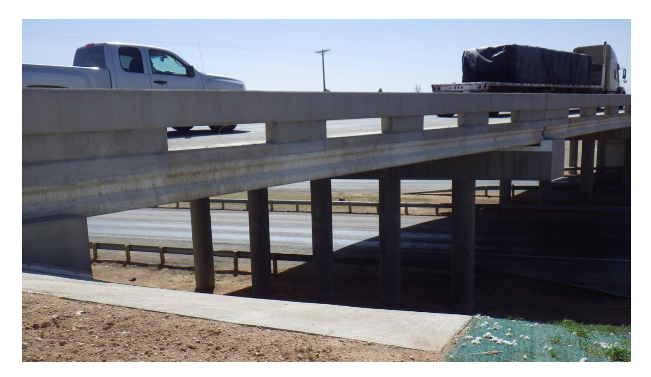
Figure 11 Completed Bridge Structure with T 223 Rail (Vertical Clearance 18.0')