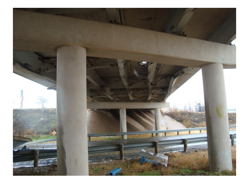
Figure 9 Damaged Bridge (Under view)