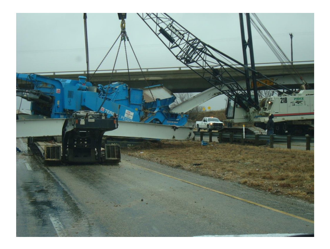
Figure 6 Damaged Bridge – US 180 Overpass at US 84 in Snyder County