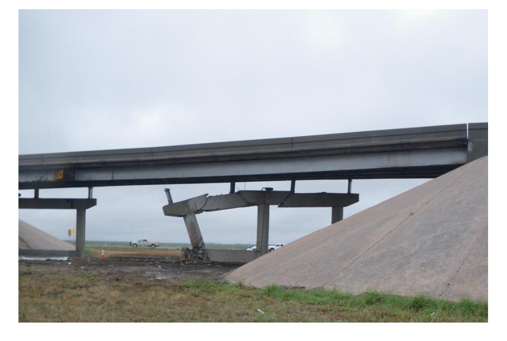
Figure 1 Overview of Damaged Bridge at US 84 over IH 20 in Nolan county

Division was on site Friday to perform a preliminary structural evaluation. The contractor was able to complete the shoring by 3:00AM Saturday morning and one lane of WB IH 20 was opened at 9:30AM. The one lane configuration for WB IH 20 was necessary due to the proximity of the shore towers to the main lanes. The US 84 EB Bridge remained closed.