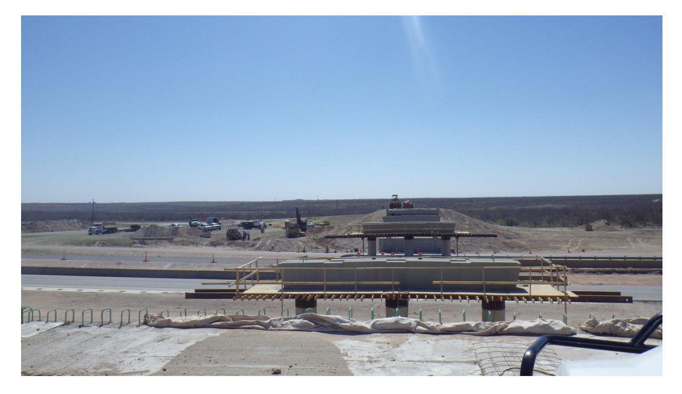
Figure 17 New Bridge with Four Spans