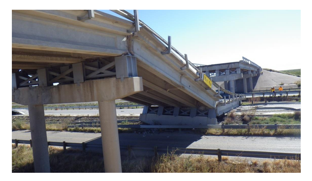
Figure 13 Overview of Damaged Bridge – IH 20 Underpass at FM 2599