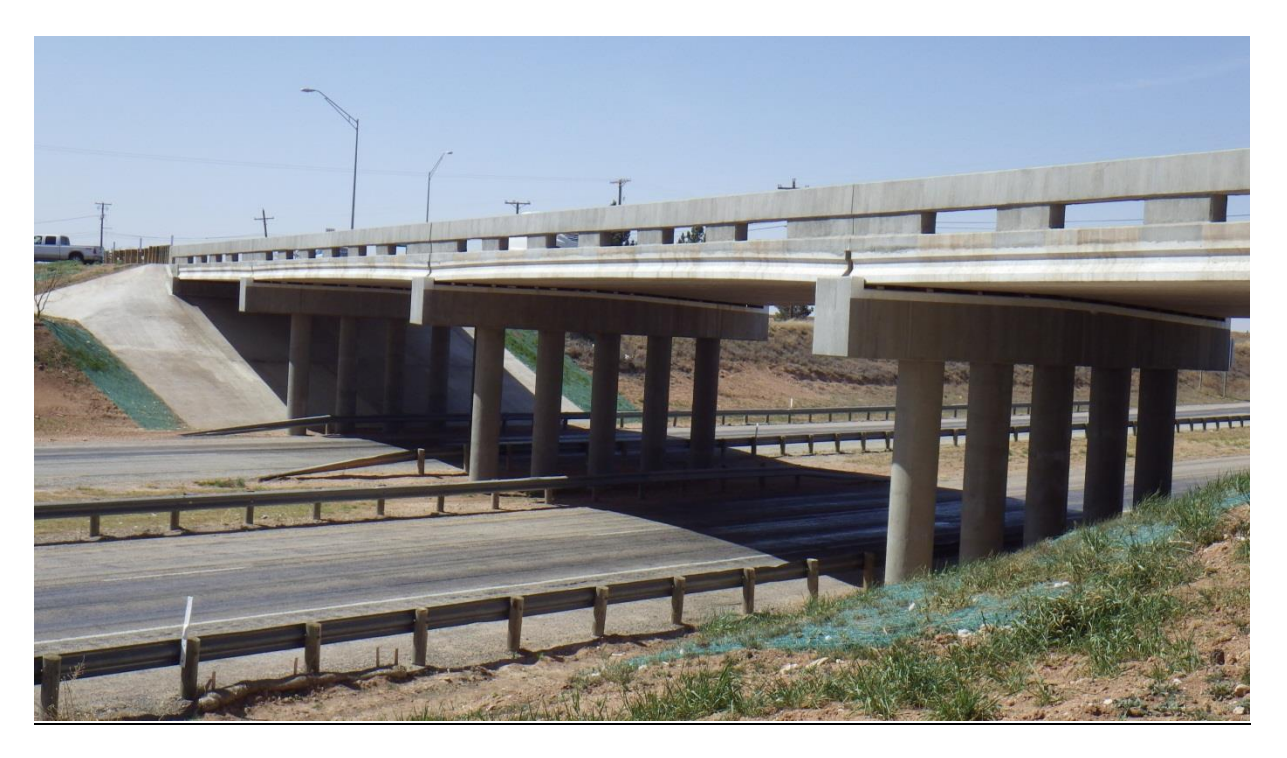
Figure 10 Completed Bridge Structure – US 184 Underpass at US 84 in Snyder County.