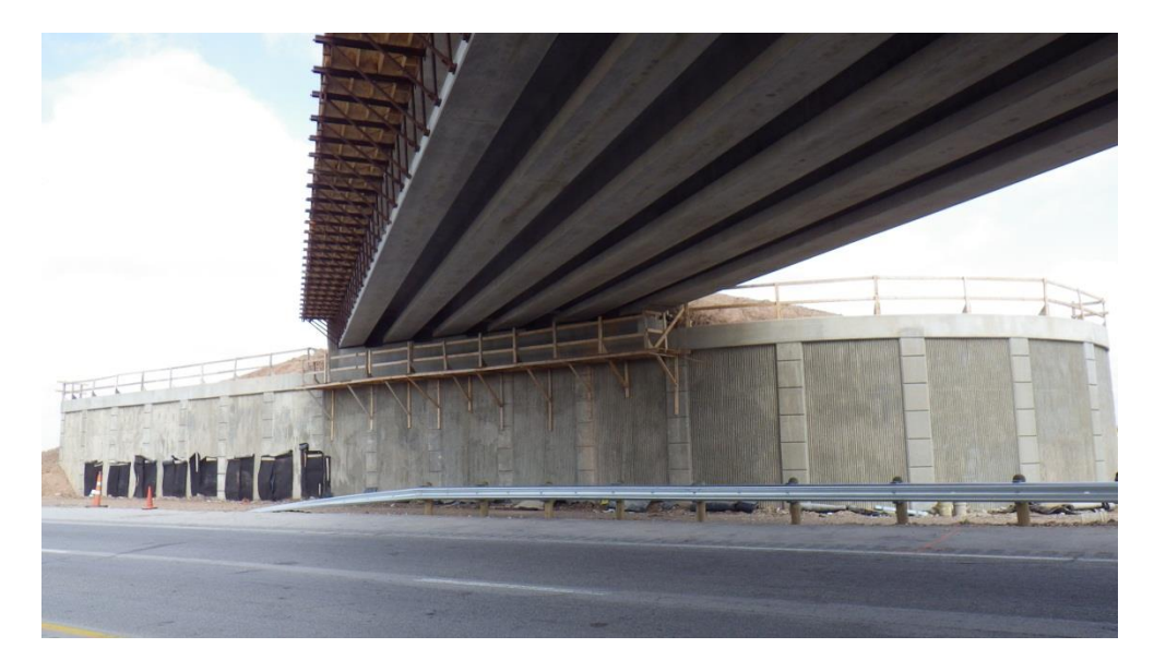
Figure 3 New Retaining wall wraps around the abutment