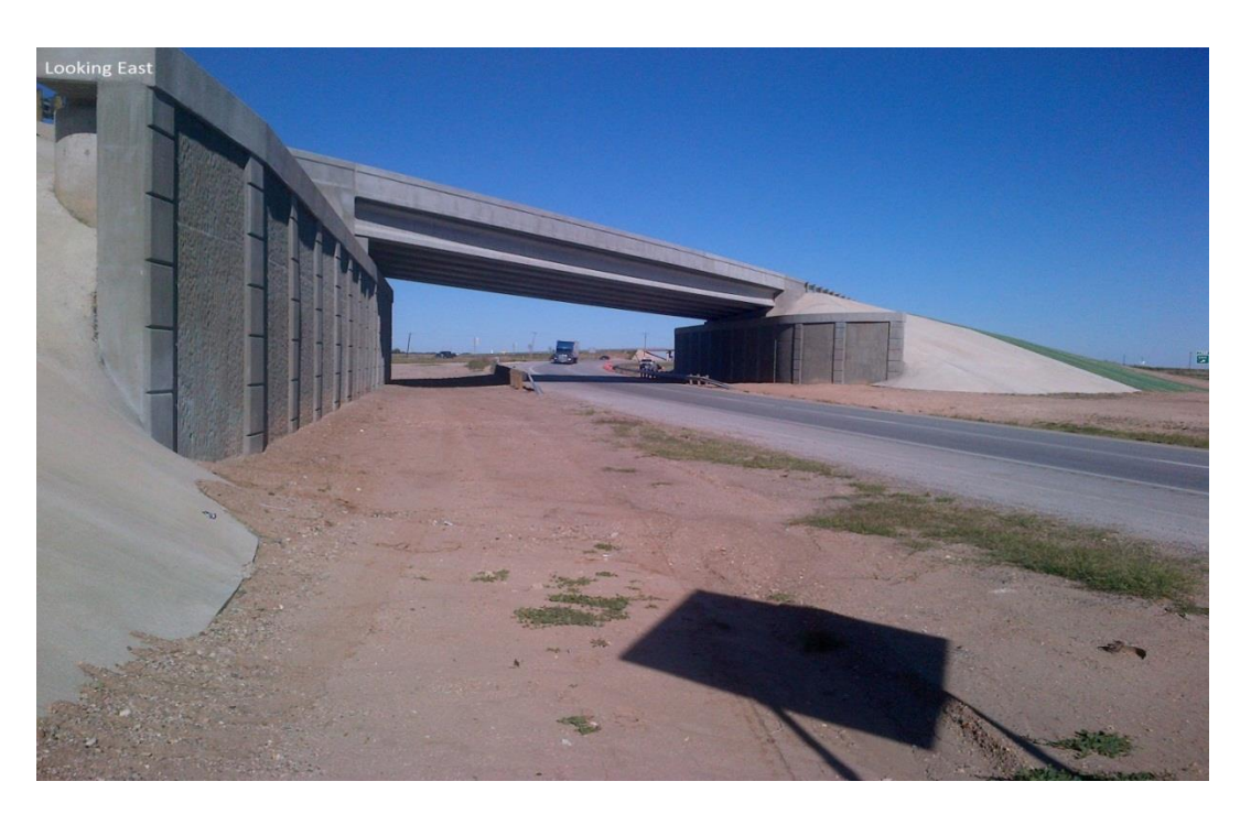
Figure 4 Completed Bridge Structure –WB IH 20 Underpass at EB US 83