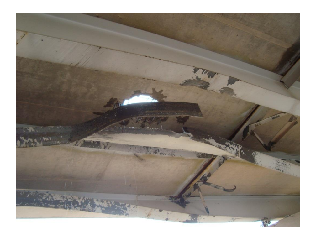
Figure 8 Damaged Bridge Concrete Deck