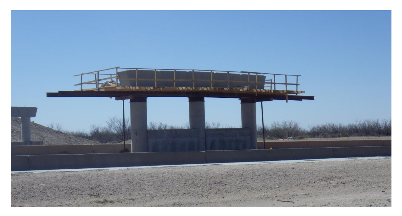
Figure 16 New Bridge Under Construction- IH 20 Underpass at FM 2599 in Howard County

Due to the collapse of the bridge, the westbound IH-20 traffic continued to be detoured to SH 176 and into Martin County until the debris was removed. TxDOT had a contractor at the site of the incident and debris removal started as soon as possible. TxDOT officials assessed the situation at IH 20 and FM 2599 and decided to expedite the contract procurement process.