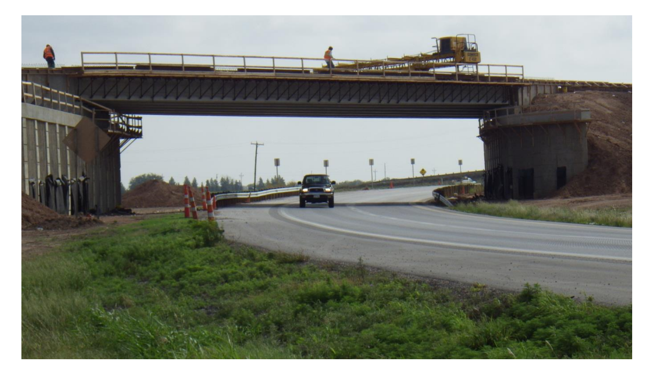
Figure 2 New single span bridge structure under construction

Both replacement bridge abutments are oriented with the same bearing, but have varying skews of 52.83 degrees and 56.73 degrees since the bridge geometry relies on a horizontal curve. The abutments have tightly spaced drilled shaft foundations because they also support a retaining wall that wraps around both ends of the bridge. Figure 2 shows the two abutments with different skew angle and support retaining wall.