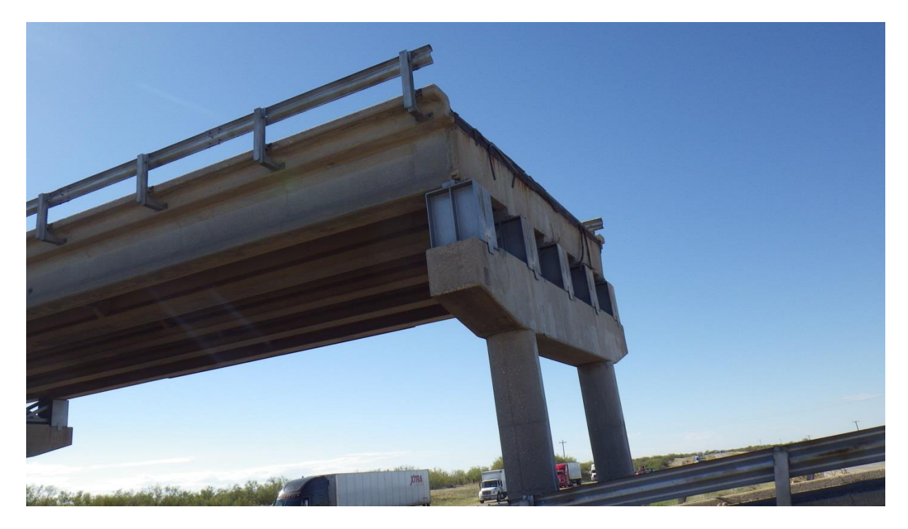
Figure 14 Partial Collapse of Columns of Interior Bent