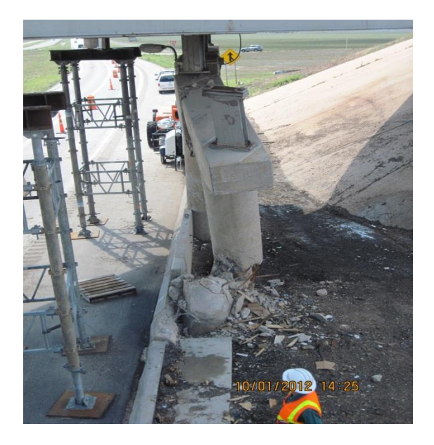
Figure 15 Damaged Columns Struck by 18-wheeler truck

The original bridge was a 305.00', 6-span structure (37.50'-50.00'-65.00'-65.00'-50.00'-37.50'). The end spans and frontage road spans were designed with Type B Prestressed Concrete Beams. The two center spans crossing over the IH 20 mainlanes were designed with Type C Prestressed Concrete Beams. The replacement bridge is a 330.00' structure, with four spans (50.00'-115.00'-115.00'-50.00'). The superstructure of the new bridge consists of Prestressed Concrete X-Beams, which are box beams that have been modified to allow for maximum span length and performance with spread framing.