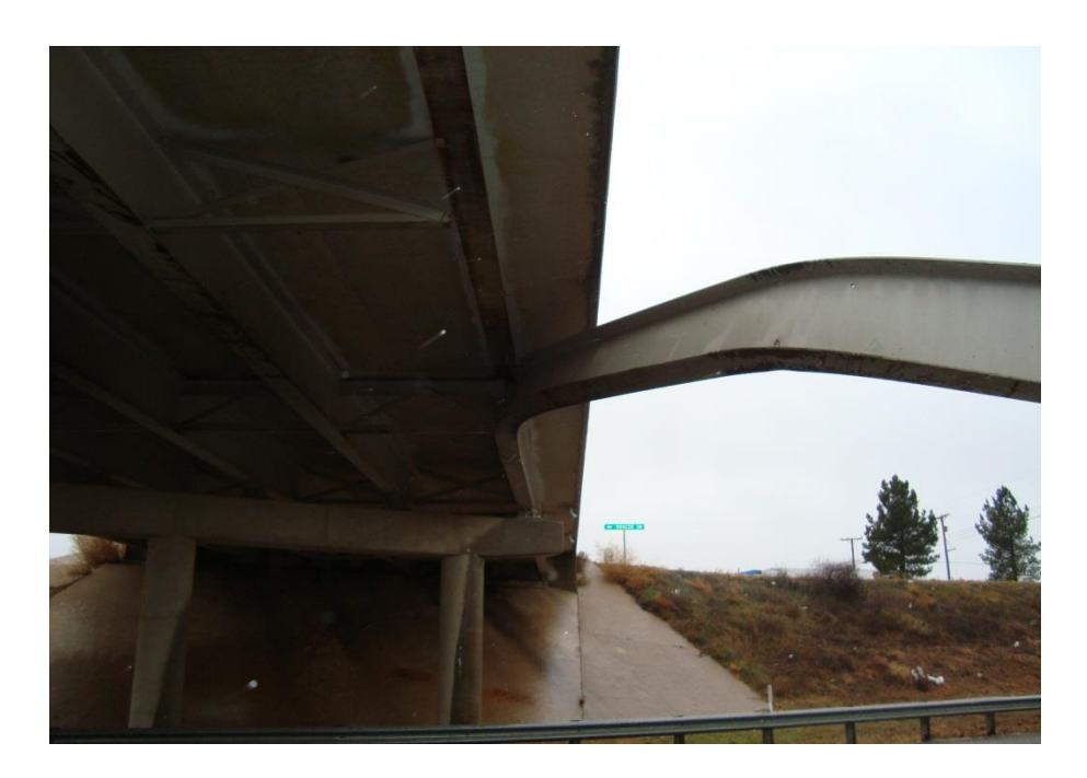
Figure 7 Steel Girder Damaged by the 18 Wheeler Truck