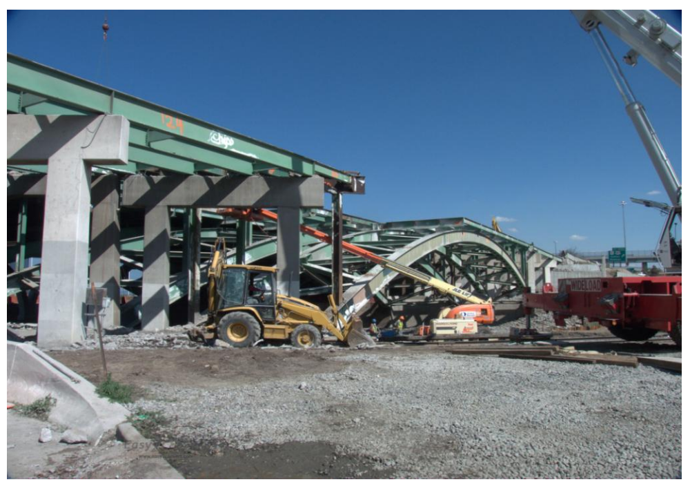
Fig. 12: Demolition of Existing Bridge

After construction of the new abutments and retaining walls was complete, demolition of the first stage of the existing bridge commenced. Bridge Demolition consisted of saw cutting and removing the deck slab in sections, then removing all superstructure framing members followed by removal of the support arches. Concrete piers were demolished after all superstructure framing was removed.