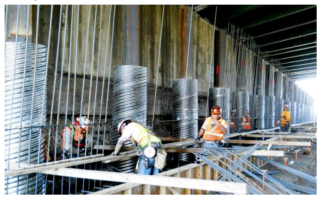
Fig. 7: Abutment Piling Encased in Corrugated Pipe through Retaining Wall Footing

Design of the abutment foundations used a single row of steel piling instead of the drilled shafts in the original design. Piling was driven under the existing bridge while the retaining walls were being built. A vibratory hammer mounted on an excavator drove the piling in long 25' sections that were spliced and re-driven to refusal into a bedrock layer approximately 30' below existing grade. PDA testing verified the piling capacities. The original design, using drilled shafts, would have required mobilizing drilling equipment and installing caissons for each phase of construction. By driving all of the abutment piling under the existing bridge, this operation was no longer on the critical path.