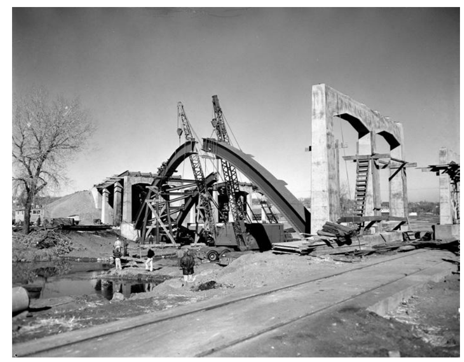
Fig. 1: Construction of original Bronco Arches, 1961

The IH25 Bridge over the Platte River has been a Denver landmark structure since the first section was constructed in 1951. Additional sections were added in 1961 and 1971 as the city grew and traffic increased. The steel arches, supporting the bridge superstructure, became a local landmark that came to be known as the Bronco Arches after the Denver Broncos began to play football in the adjacent Mile Hi Stadium in 1960.