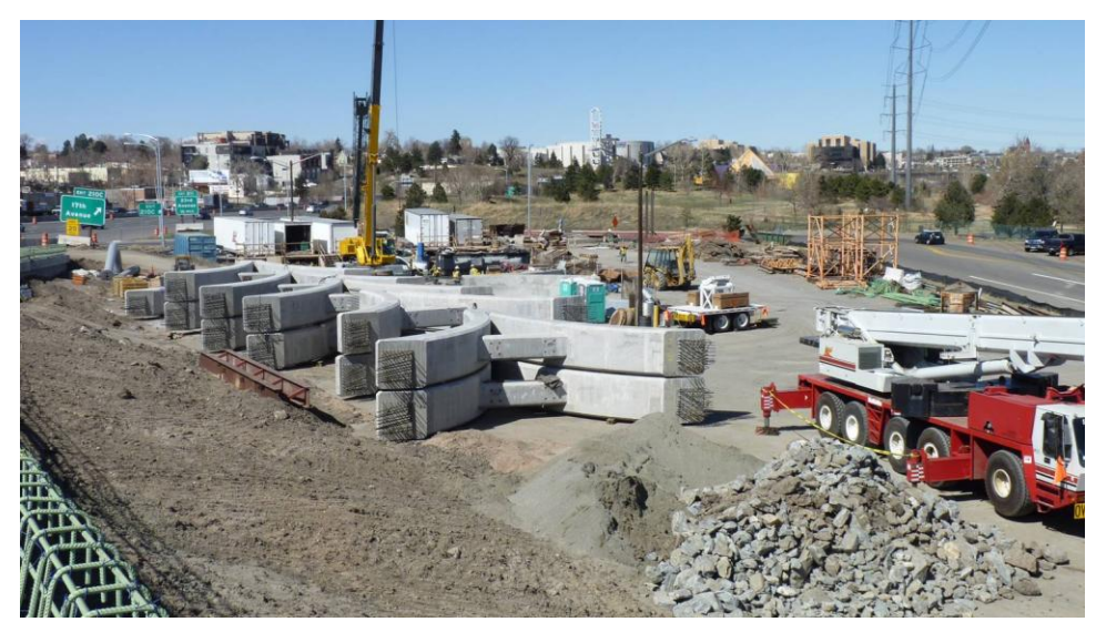
Fig. 11: Storage of Precast Interior Piers