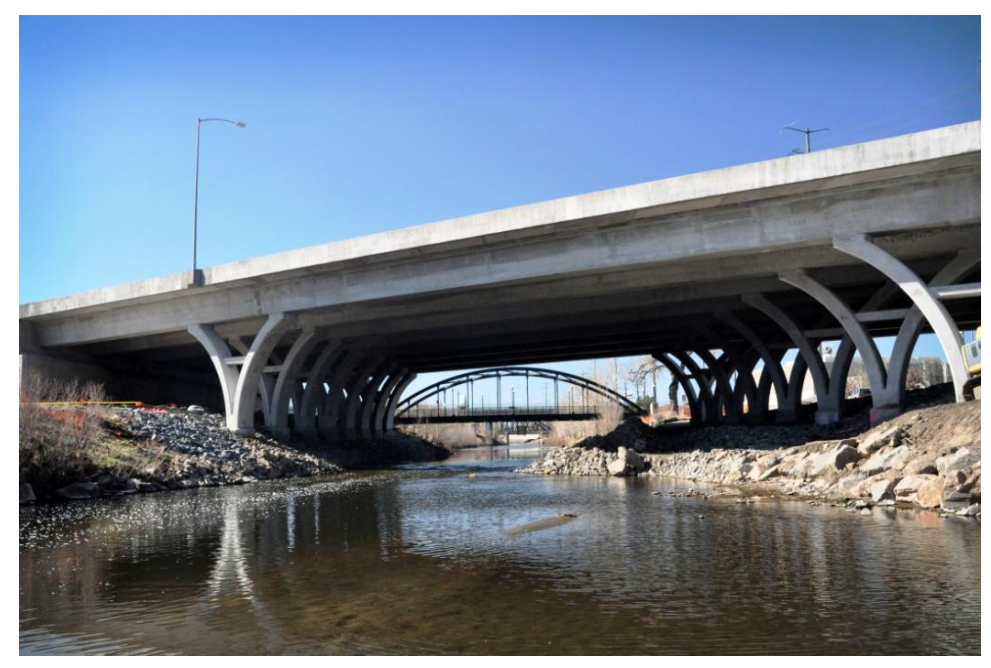
Fig. 5: New Bronco Arch Bridge spanning over the Platte River, March 2013

The Contractor, Lawrence Construction Co. of Littleton, CO requested that CDOT consider a number of Value Engineering proposals that would enhance the design of the bridge, reduce the number of stages of construction, shorten the schedule and greatly reduce the impact on existing traffic. CDOT recognized that the Value Engineering proposals suggested by the Contractor would result in less disruption and a shorter schedule and allowed them to proceed. Lawrence retained Summit Engineering Group, Inc., of Littleton CO to design an alternate bridge structure as well as the retaining walls at the embankments at each abutment.