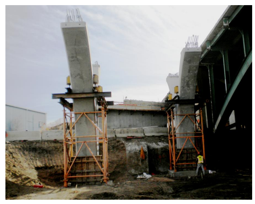
Fig. 14: Precast Piers on Temporary Shoring

After the piers were secured on the shoring towers, the reinforcing and forms for the support pedestal were set in place and the pedestals were cast. Pedestal concrete had minimum design strength of 4500 psi. Typically the pedestals were cast the day after the piers were erected. Once the pedestal concrete reached design strength, the bridge was ready for precast girder erection. Superstructure girders were erected 8 to 14 days following erection of precast piers.