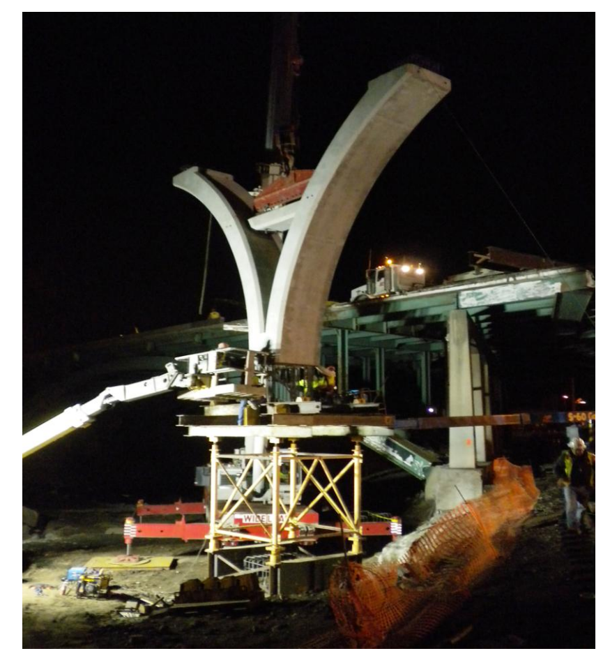
Fig. 13: Erection of Precast Piers

The pier foundations were designed with 4,000 psi minimum concrete strength and approximately 1.5% vertical reinforcing that extended 4 feet into the column pedestal above. The supporting bedrock consists of a siltstone layer approximately 30 feet below existing grade. Drilled shafts penetrations into the siltstone varied from 14 to 18 feet. The recommended nominal design values of resistance of the bedrock were 6 kips of side friction and 200 to 240 kips of end bearing per square foot.