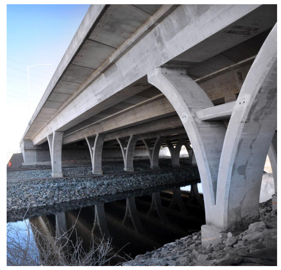
Fig. 9: Interior Pier and Pedestal Details