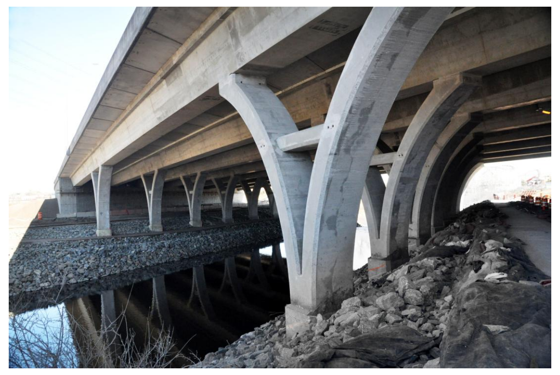
Fig. 19: Completed Bridge, March 2013

After the deck tendons were stressed, the approach slabs were cast at each end of the bridge. Expansion joints were installed at the end of the approach slabs and an asphalt overlay was applied prior to shifting traffic. Once traffic is shifted on to the new section of bridge, the next phase of demolition and construction begins until the bridge is complete.