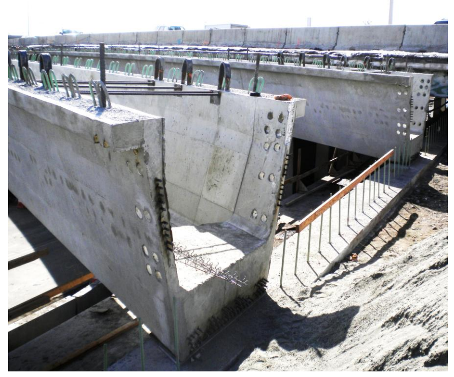
Fig. 15: U72 Precast Girders on Abutment Cap

Each girder line consists of 3 precast U72 girders cast in lengths of 95.0', 136.5' and 133.5'. Girder weights varied from 170 kips to 210 kips.