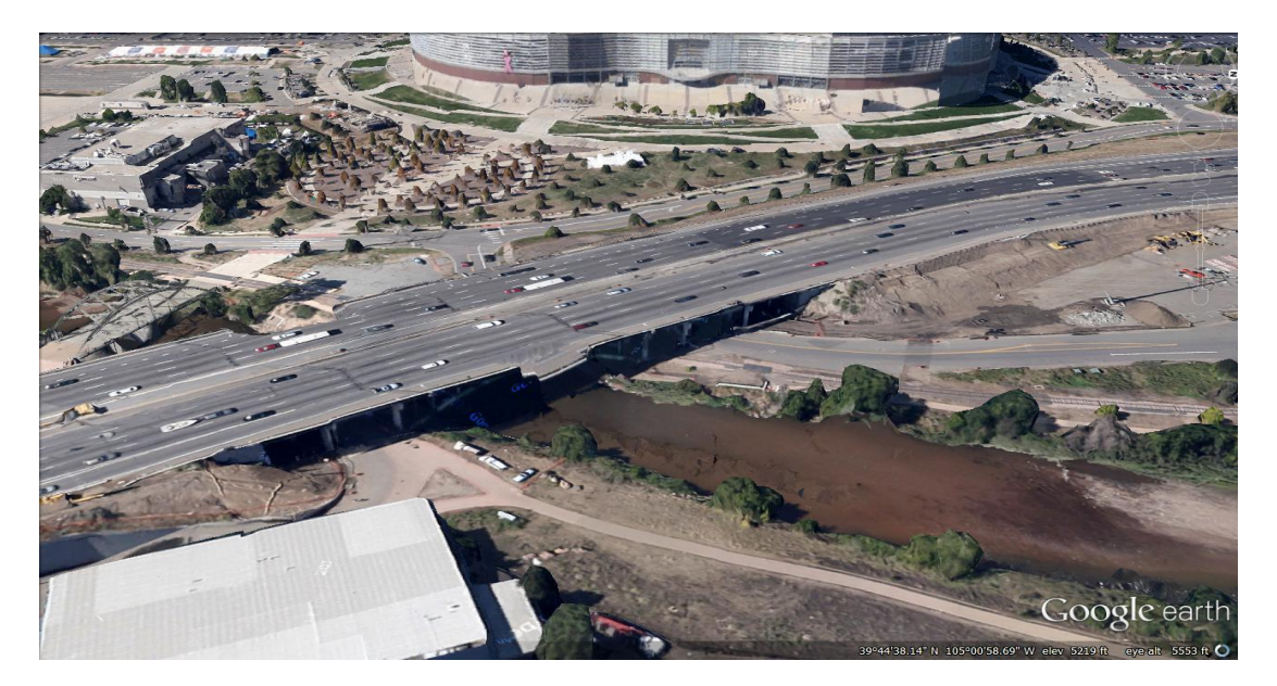
Fig. 2: Aerial View, IH25 Bridge over the Platte River

The new bridge was built on the same location as the original bridge but is shorter in length and has a wider deck. The bridge was planned to be constructed in five separate stages. Each stage of construction included demolition of the existing bridge, construction of the substructure and superstructure of the new bridge and movement of traffic lanes.