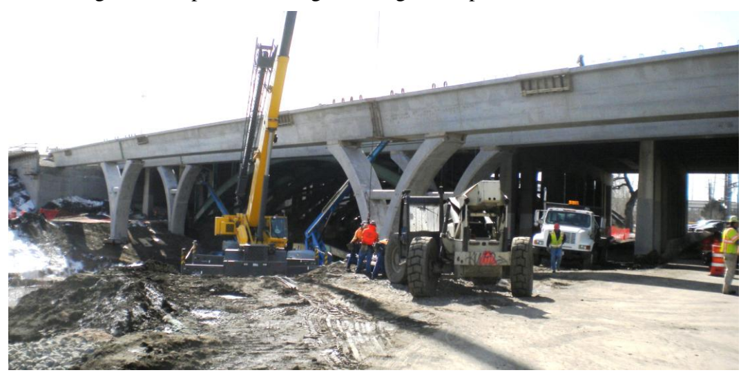
Fig. 17: Continuous Girder Line

Unique prestressing patterns were developed each of the 3 different girders using a combination of straight, draped and debonded strands. Strand profiles differed at each end of each individual girder as well. Once the girders were spliced and connected to the substructure, they are post tensioned with a 12 \times 0.6 " diameter, 270 ksi strand tendons in each of the girder top flanges over each interior pier. The design creates a combination of pretensioning and post tensioning that resulted in a fully prestressed, continuous girder line prior to setting the bridge deck panels.