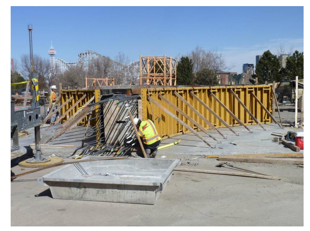
Fig. 10: Precasting of Interior Piers

The pier shafts are connected with a concrete strut at mid height. The piers connect to the drilled shaft foundation with a cast-in-place, reinforced concrete pedestal. A capital at the top of each pier shaft supports the each girder line of the superstructure.