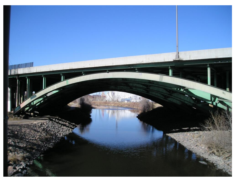
Fig. 3: Bronco Arches spanning over the Platte River, March 2011

The new bridge was built on the same location as the original bridge but is shorter in length and has a wider deck. The bridge was planned to be constructed in five separate stages. Each stage of construction included demolition of the existing bridge, construction of the substructure and superstructure of the new bridge and movement of traffic lanes.