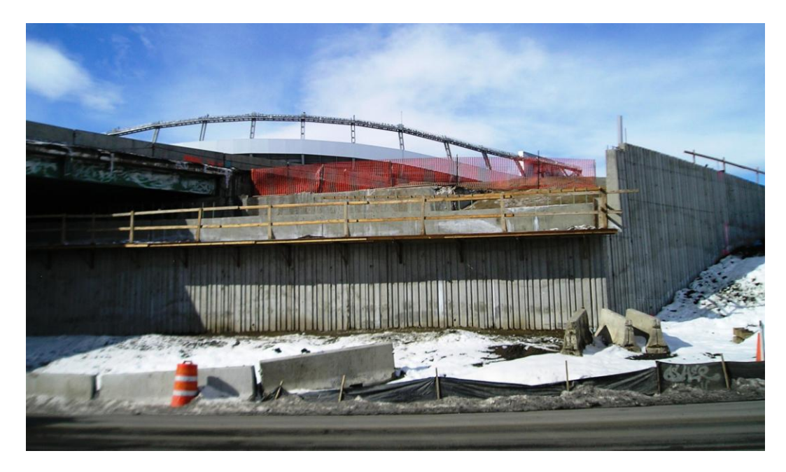
Fig. 8: Abutment and Wall Construction under existing Bridge