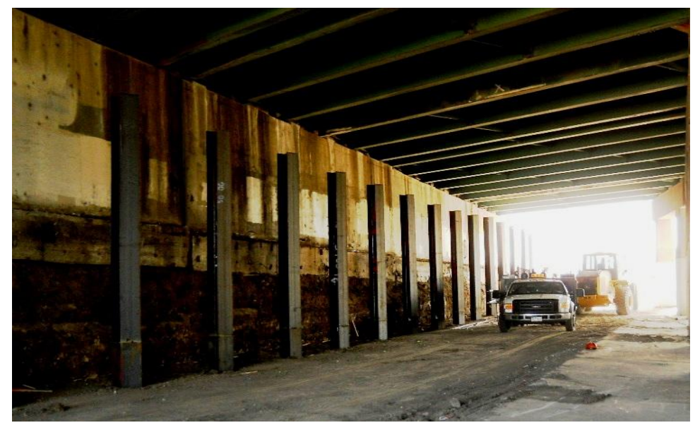
Fig. 6: Abutment Piling Driven under Existing Bridge

The design of the wall system enabled the Contractor to get an early start and significantly complete construction prior to commencing bridge construction operations. The bridge design was developed with a sequence of construction that relied heavily on the utilization of precast elements to shorten the duration of each of the four stages of construction and minimized the time between each stage. Integration of the Design and Construction Engineering through the process resulted in a well developed set of operations that could be successfully repeated in each Stage of construction.