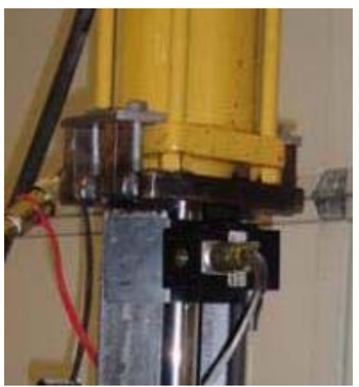
Fig.4: Linear Encoder