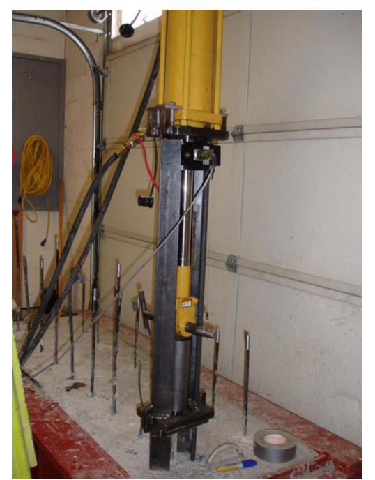
Fig. 3: LBPT Test Setup