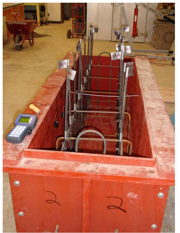
Fig. 2: Form and Strand Samples from LBPT at UA