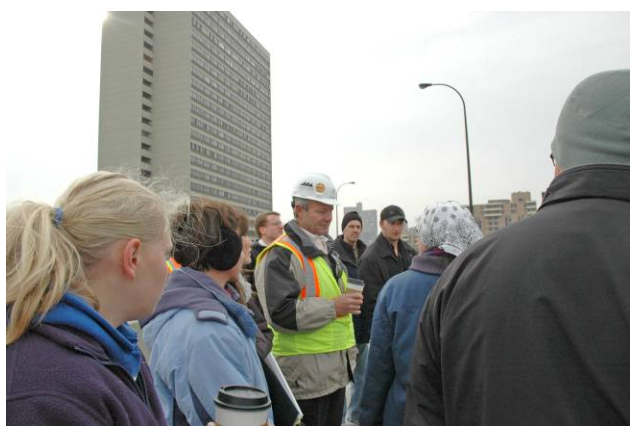
Figure 18 – Sidewalk Superintendent Talks

even in the winter, in -10° F weather, we always had a dozen or so hardy folks show up for these talks. In more temperate weather, more than 100 people have participated.