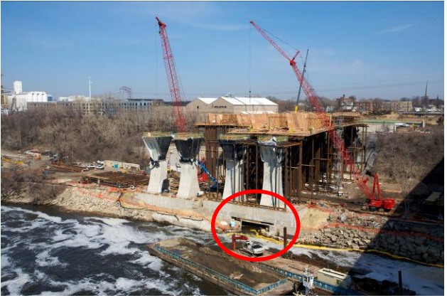
Figure 5 – Footing Straddling Storm Drain

The main foundations are 7' and 8' diameter drilled shafts approximately 100' long and socketed into bedrock. The shafts were installed using slurry construction methods with self-consolidating concrete. The footings were designed to straddle over some of the original foundations and extensive storm drains on each side of the river (see Figure 5). Each footing varies in longitudinal length from 34' to 43' and in width from 81' to 112'. Depths also vary from 13' to 16' depending on footing location.