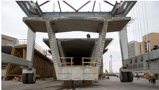
Figure 11 – Segments

Each cantilever is approximately 250' long and contains 15 precast segments. Segments vary in length from 13.5' to 16.5', and depths from 25' to 11' (see Figure 11). Weight varies from 380 kips to 216 kips each. Once a completed cantilever was finished, the segments were split apart then hauled to the river shore to await erection by barge-mounted crane.