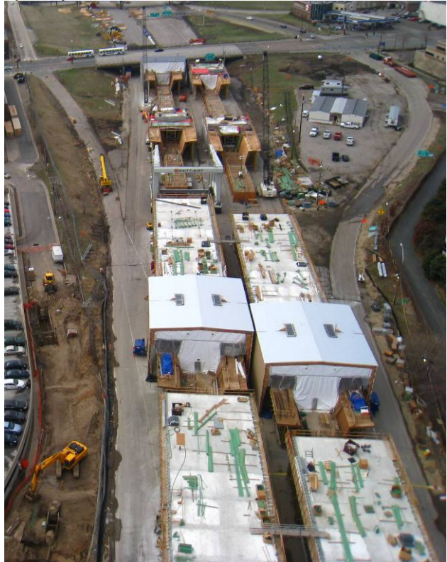
Figure 9 – Casting Yard

simultaneously precast at the casting yard (see Figures 9 and 10). Eight longline casting beds were utilized for precasting. These beds were constructed on top of the existing southern highway approach for the previous bridge. All longline beds were operational at the same time and were used only once. Rolling heated structures, following the segment casting, provided a suitable work and curing environment during the winter months. The precasting started in late January and was complete by early June