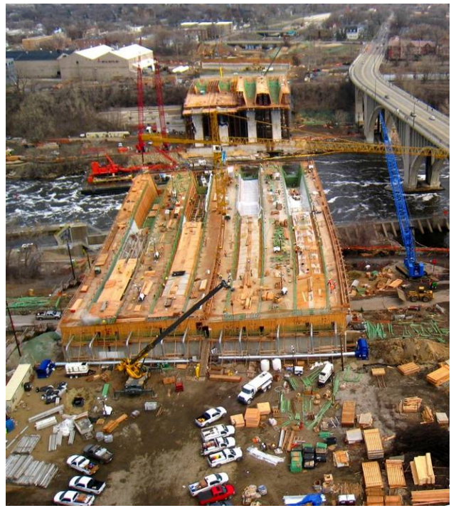
Figure 10 – Back Spans on Falsework

Each cantilever is approximately 250' long and contains 15 precast segments. Segments vary in length from 13.5' to 16.5', and depths from 25' to 11' (see Figure 11). Weight varies from 380 kips to 216 kips each. Once a completed cantilever was finished, the segments were split apart then hauled to the river shore to await erection by barge-mounted crane.