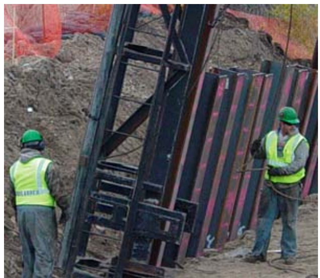
Figure 4 – Footings on South side of River

The main foundations are 7' and 8' diameter drilled shafts approximately 100' long and socketed into bedrock. The shafts were installed using slurry construction methods with self-consolidating concrete. The footings were designed to straddle over some of the original foundations and extensive storm drains on each side of the river (see Figure 5). Each footing varies in longitudinal length from 34' to 43' and in width from 81' to 112'. Depths also vary from 13' to 16' depending on footing location.