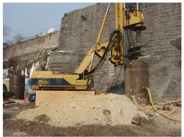
Figure 6 – Drilling Shafts from Land

No piers were located in the water (see Figure 6). This project constraint was stipulated to reduce potential scour damage and to preserve the navigation channel. This constraint actually had several advantages during design and construction that streamlined the schedule. During design, loadings due to ice, barge, and stream flow forces were small thus simplifying the design effort. For construction, crews and equipment (drilling rigs, cranes, and concrete pump trucks) had direct access to critical areas along the shore.