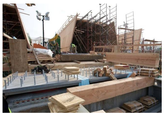
Figure 8 – Large Bearings