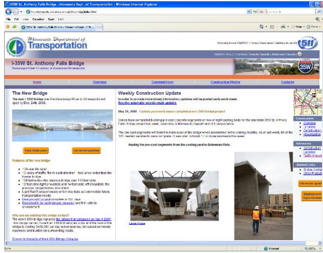
Figure 19 – Website

At two locations in the Twin Cities (Minneapolis-St. Paul Airport and the Mill City Museum), kiosks that provide information on the project, were placed to help travelers and visitors understand the project. A project website is also maintained and receives approximately 400 visitors a day (see Figure 19). A large percentage of viewers monitor the up-to-theminute web cameras, review construction progress and the latest project images. Interested individuals may also sign up to receive a weekly construction update email, including attached images. The project website may be reached through www.mndot.gov.