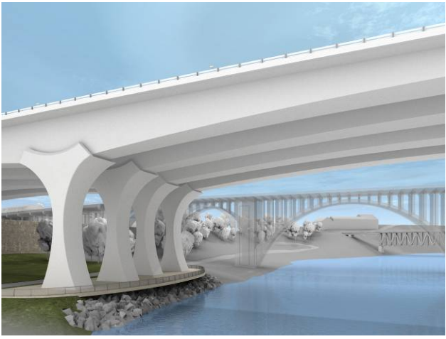
Figure 7 – Piers

(see Figure 8). Each of these bearings have a service capacity of 5,900 kips. Sliding bearings tend to be more maintenance intensive. Extensive modeling and analysis showed that design frictional forces in bearings were similar to shears applied by a pinned bearing system for both piers. Therefore, the bearings for all main piers, are pinned against translation in all directions. Pier extensions on each side to protect and conceal the bearings.