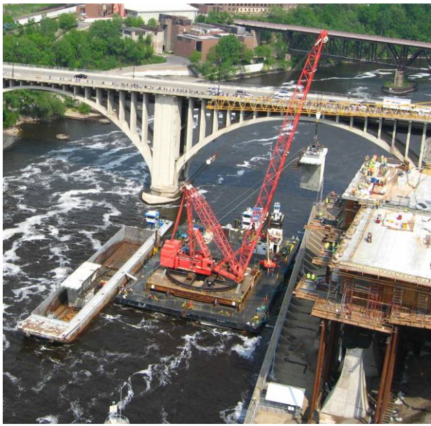
Figure 13 – First Precast Erection May 25, 2008