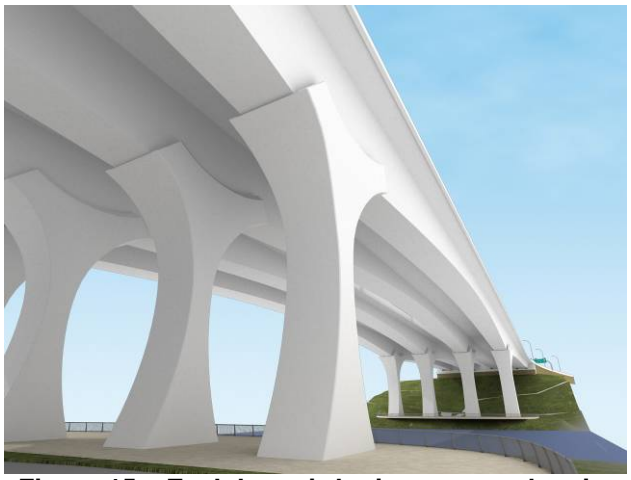
Figure 15 – Each box girder is supported on its own column and own set of drilled shafts

Numerous redundant load paths have been designed into the new structure. Multiple foundation elements, footings, columns, box girders and post-tensioning have been incorporated, creating no fracture critical elements (see Figure 15). Also, the north and southbound structures are separated, significantly reducing any potential interaction between the two during an extreme event.