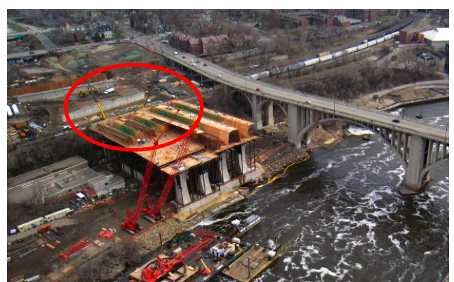
Figure 12 – Railway on Bluff at North Side of Bridge

The north side of the bridge must clear an active railway located on the edge of a bluff (see Figure 12). In addition, the roadway alignment had to be low enough to clear under an existing overpass north of the project. Distribution of bending forces was optimized in Span 4 (which crosses the railroad) by designing the superstructure integral with the north abutment. This allowed for a slender span that satisfied both above and below deck clearance challenges.