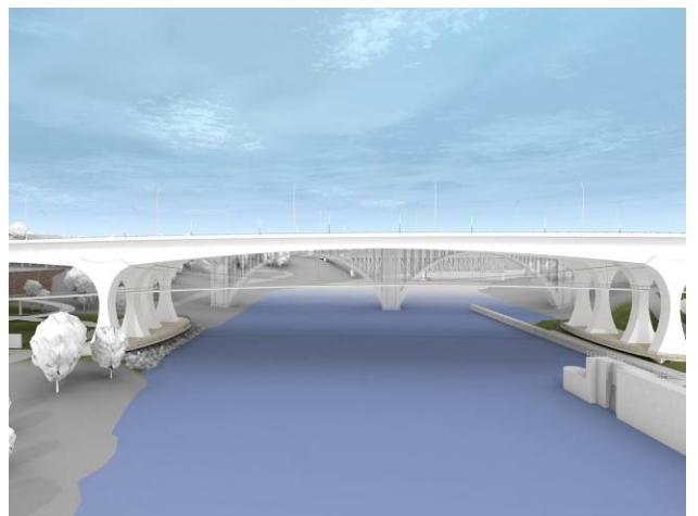
Figure 17 – Rendering of Hanging Pedestrian Bridge

In addition, there will be extensive landscaping throughout the project site, and public observation decks at river level surrounding the main piers, adjacent to the river. The southbound structure has also been designed to accommodate a future pedestrian bridge to gracefully hang under and between the box girder sections (see Figure 17).