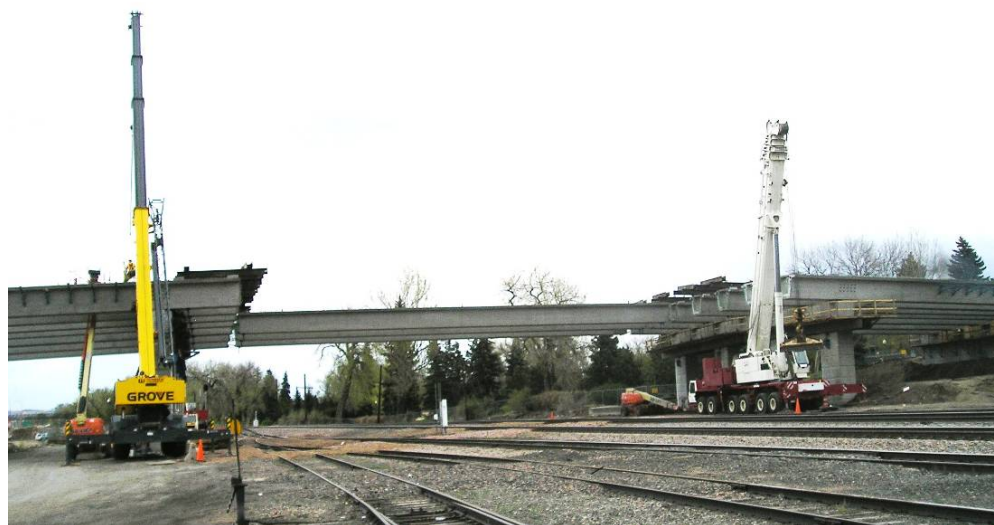
Fig. 6: Erection of Precast Girders in Span 3 over Rail Yard

adjacent girders. At each splice, the unsupported end of each girder was suspended from the strongbacks by 2 – 1 3/8" diameter post tensioning bars. The girders were designed with extensive debonding of the pretensioning in the bottom flange and a post tensioning tendon, in the top flange of each web, over the piers to accommodate stresses due to erection loadings.