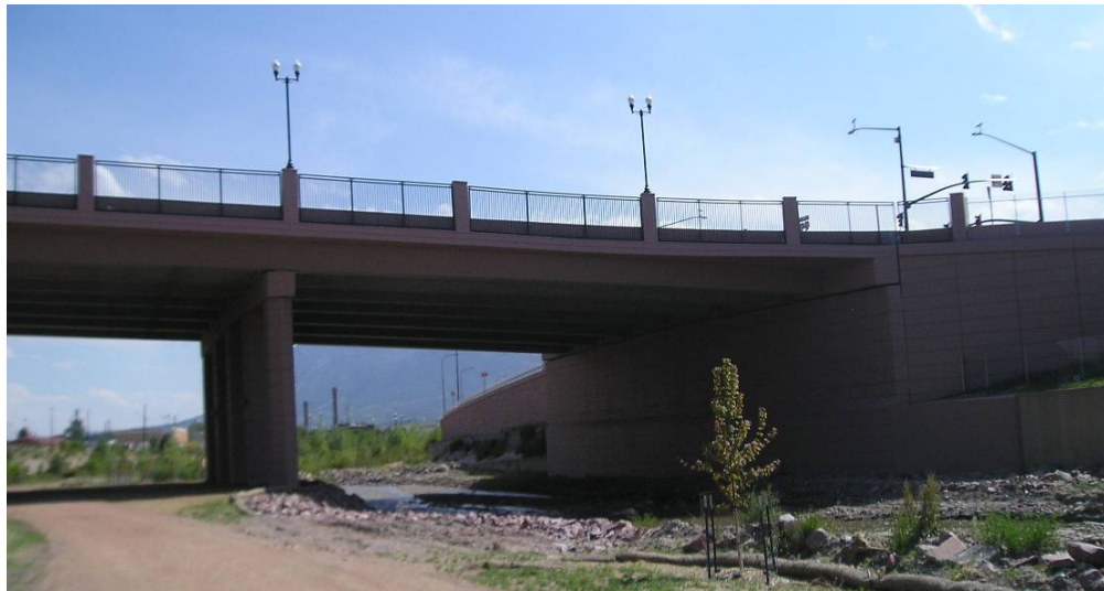
Fig. 4: West Abutment and Span over Monument Creek

The design of the new abutment called for a 3'-0" thick wall pier that was cast against the existing retaining walls. The new wall encased the existing retaining walls in the back fill behind the new abutment and avoided the need for demolition. Holes were drilled through the existing abutment wall and tie backs were anchored in the new abutment and to dead men anchors in the back fill.