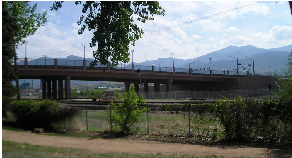
Fig. 16: Completed Bridge Open to Traffic – September 2007

Demolition of the existing structure started on January 4 and took two months to complete. The substructure was constructed and girder erection took place in April. The bridge was reopened to traffic in late September, two months ahead of schedule.