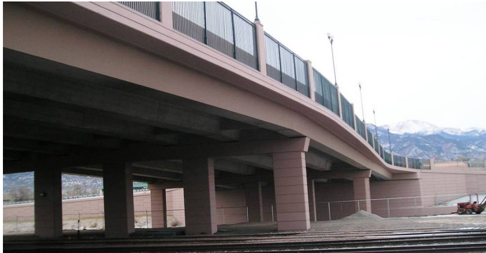
Fig. 8: Girder Layout in Spans 2 to 4, Looking at West Abutment

varied from 22.75' to 13.20'. The typical deck slab overhangs varied from 2.50' to 3.50'. The overhangs increased to a maximum of 17.40' on each side of the bridge at the west abutment curved turn lanes for the on and off ramps from IH25.