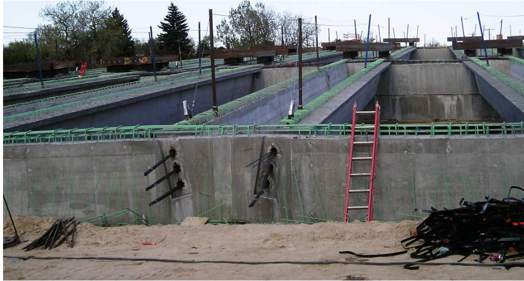
Fig. 11: Cast-In-Place Abutment and Interior Pier Diaphragms

continuous layer of isolation material was placed on each face of the diaphragms the interface between the pier and diaphragm to prevent spalling due to rotations of the superstructure and provide an effective pinned connection between superstructure and foundations.