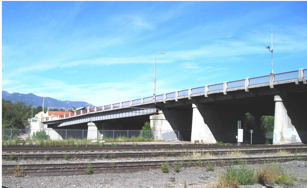
Fig. 15: Existing Bijou Bridge Prior to Demolition – January 2007

holiday season would have seriously affected the local merchants.