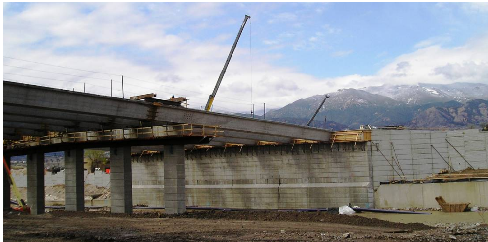
Fig. 14: Completed West Abutment

The abutment wall had full height MSE wall panels on either side that tapered back to existing retaining walls. The completed abutment and adjoining retaining walls form a channel liner for Monument Creek at flood stage as well as provide support for the bridge and roadway above.