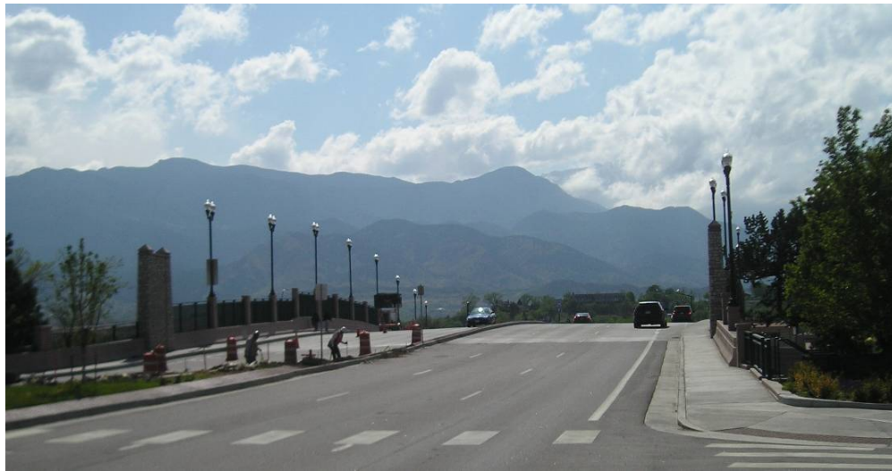
Fig. 2: Bijou Avenue Bridge Roadway Looking West

The City of Colorado Springs wanted a bridge that would relieve congestion and accommodate multiple movements of traffic into and out of the downtown area, as well as provide access to the west side of town which is bisected by IH25. The bridge matches the lanes from the new IH25 overpass to provide 3 continuous lanes of traffic into the downtown area, two lanes across IH25 into west Colorado Springs, two left turn lanes to provide freeway access and sidewalks and bike lanes in both directions.