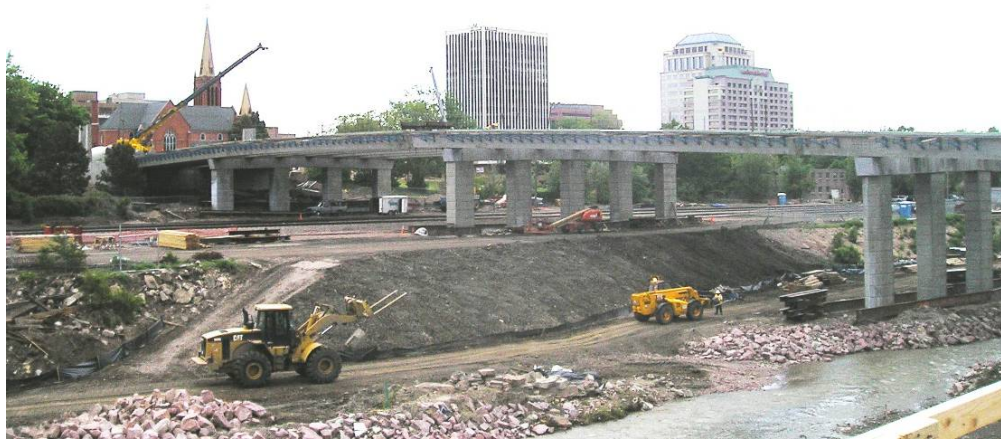
Fig. 12: Continuous Girders at Stressing of Longitudinal Post-Tensioning