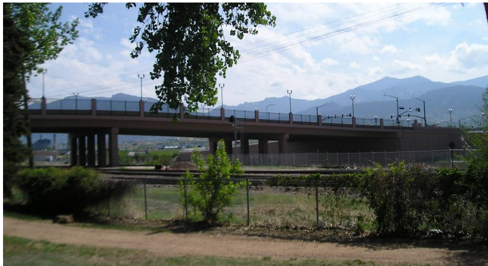
Fig. 1: Bijou Avenue Bridge

Precast concrete girders were designed to cantilever beyond interior piers and support the free end of the adjacent girder during erection. An innovative combination of debonded pre-tensioning, post-tensioning and internally thickened section of the webs and bottom slab was used to accommodate cantilevered construction. Strongbacks were used at girder splices to eliminate the need for temporary shoring supported in the creek or the rail yard during construction. The bridge was fully post tensioned between abutments after splices were cast and prior to placing the deck slab.