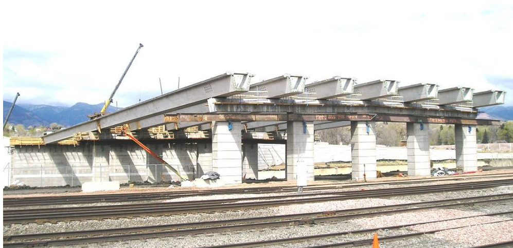
Fig. 5: Erection of Precast Girders in Spans 1 & 2 over Monument Creek

Using this erection scheme, the end spans were erected from each abutment and cantilevered 15' past the first interior pier at each end of the bridge. Girders in Span 2 spanned from a splice, 15' up station of Pier 2 and cantilevered 15' past Pier 3, at the center of the bridge, into the west side of the rail yard. Drop in girders were supported over the rail lines from the girders cantilevering over Pier 3 from the west and Pier 4 from the east side of the rail yard.