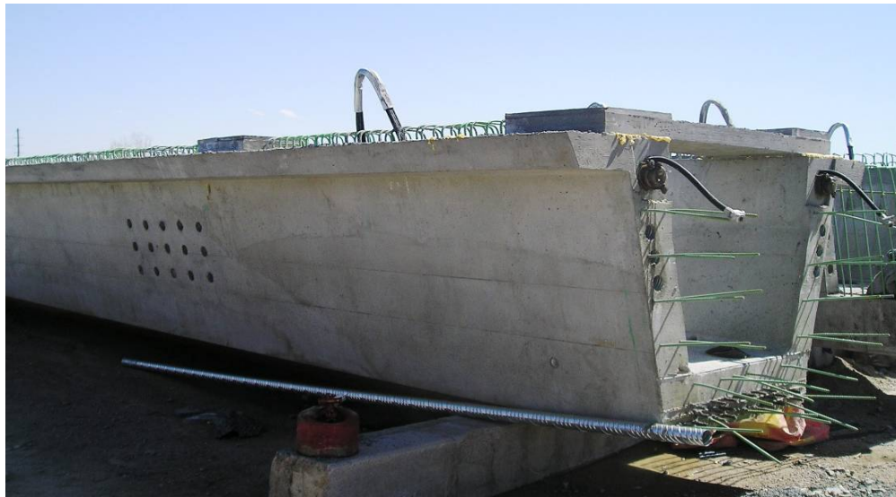
Fig. 9: Cantilevered End of Precast Girder

The design of the precast girders incorporated features that would be necessary for erection. The design of the girders was developed with the Joint Venture's Precaster to utilize existing forms. To accommodate the cantilevered erection scheme, post tensioning tendons were placed in the webs near the top flange. A thicker web and tapered bottom flange were designed using forms that were used on a previous project.