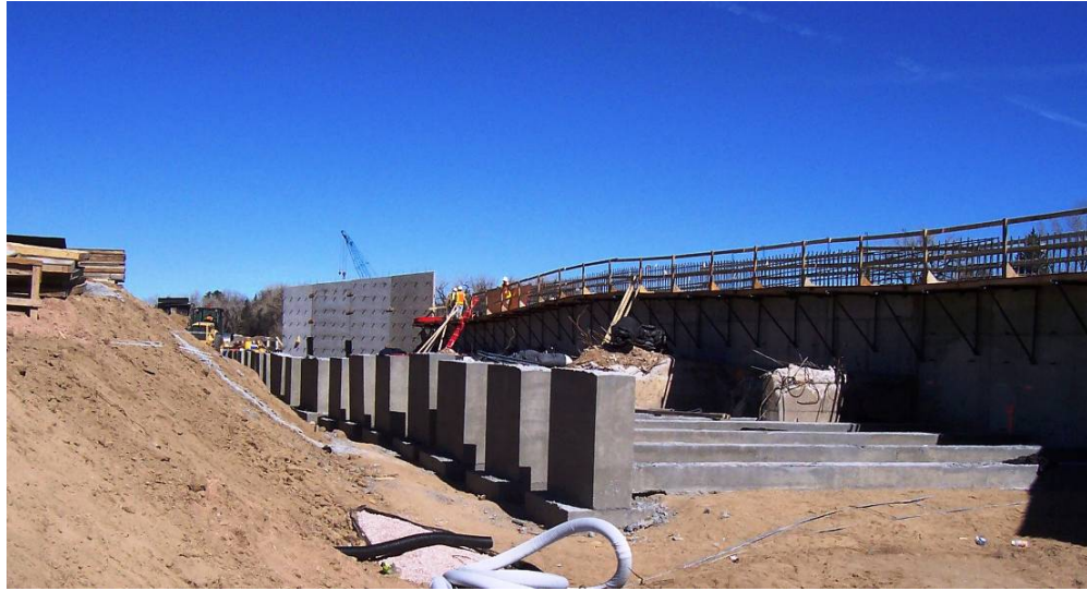
Fig. 13: Dead Man Anchors and Tie Beams at West Abutment Wall Pier

The abutment wall had full height MSE wall panels on either side that tapered back to existing retaining walls. The completed abutment and adjoining retaining walls form a channel liner for Monument Creek at flood stage as well as provide support for the bridge and roadway above.