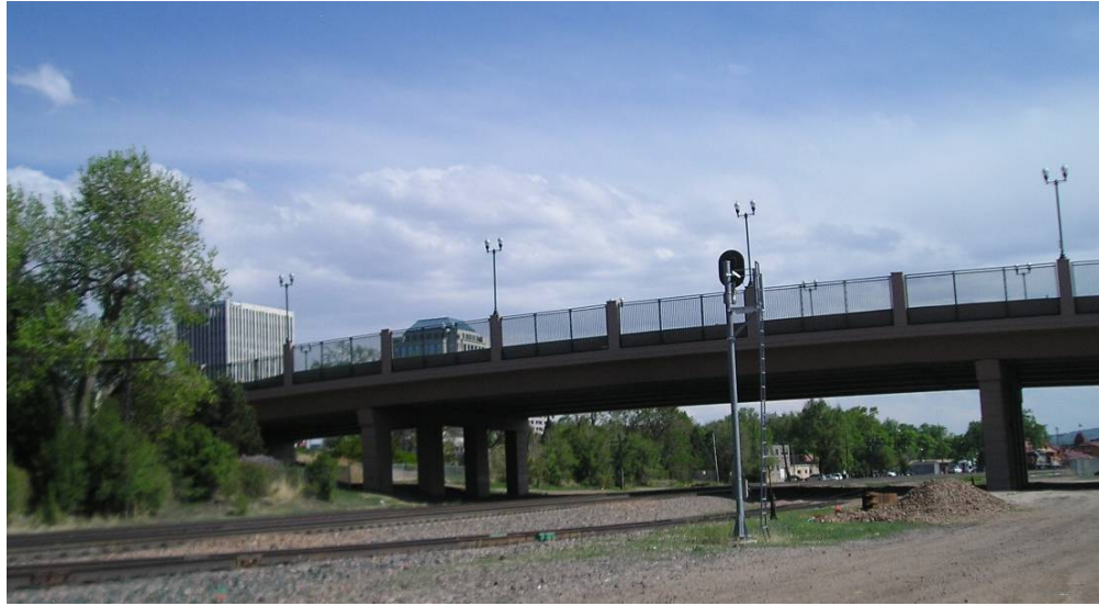
Fig. 3: Bijou Bridge over Rail yard

abutment provided a vertical wall that served as a channel liner for Monument Creek. The new west abutment would have to provide the same vertical surface and dovetail with the retaining walls on either side of the bridge. The existing retaining wall was over 30 high and consisted of a combination of counter fortified retaining walls and infill tie back walls that were forty to eighty years old.