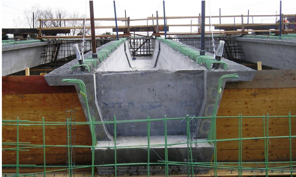
Fig. 10: Precast Girder at Abutment and Interior Pier Diaphragms

Four bays of seven girders were used. Three bays had cantilevered sections and the railroad drop in girders had a typical section from end to end. The girder lengths in each bay were 121.5', 133.0', 114' and 102'.