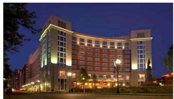
Fig. 2 The Heldrich, New Brunswick, N.J.

The Heldrich in New Brunswick, N.J. is a luxury condominium/hotel project that opened in 2007 with 10" thick lightweight cladding panels that couldn't have been achieved with conventional precast [FIGURE 2]. The weight would have exceeded crane capacity and practical structural limits. This project was recognized by the Precast Concrete Institute's Harry H. Edwards Industry Advancement Award.