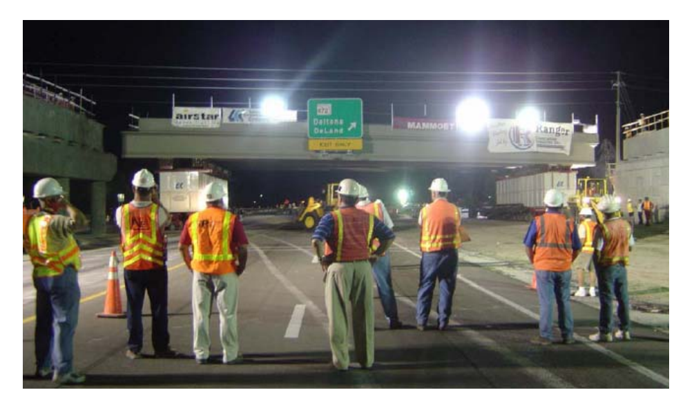
Fig. 5 Installation of Graves Avenue Span over I-4 East, Florida

FDOT obtained a new 2-span bridge over I-4 four months sooner and with only hours of impact to Interstate traffic. They plan similar projects in the future.