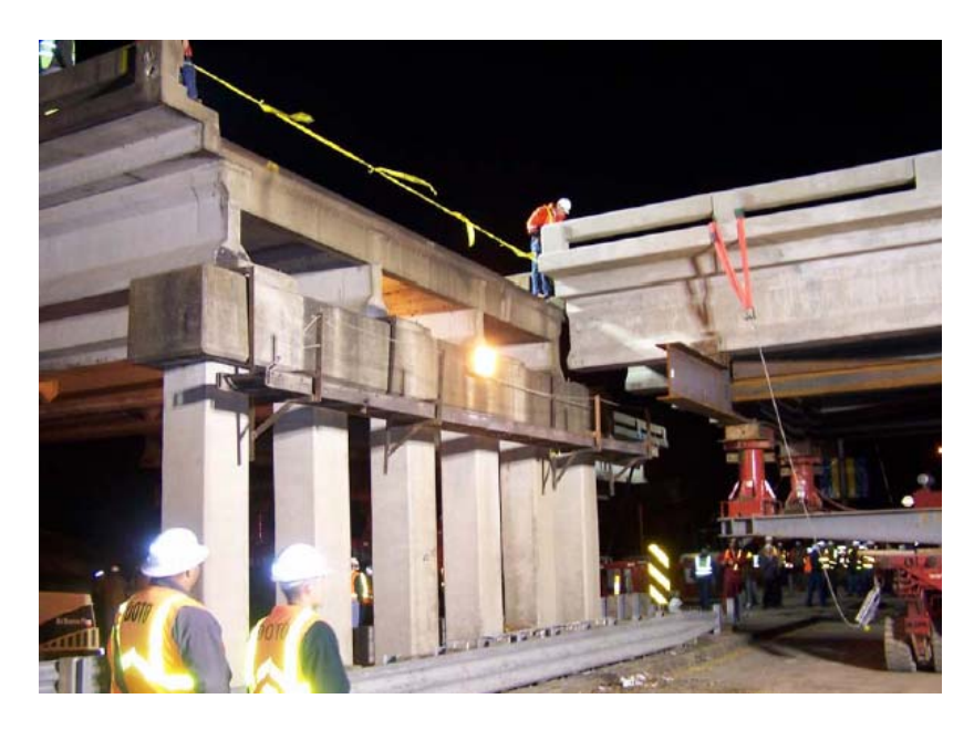
Fig. 6 Installation of New I-10 East Span, Louisiana

new span was moved into position, as shown in Fig. 6. The entire process from moving in the SPMTs to remove the damaged span to setting of the new span took approximately 30 minutes.