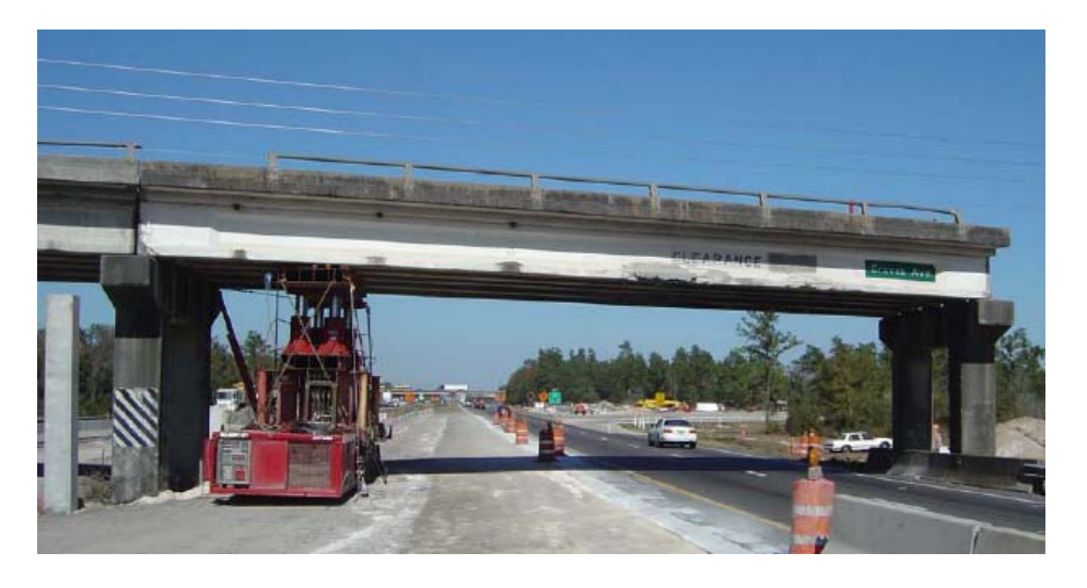
Fig. 2 Pre-positioned SPMT Unit at Existing Span over I-4 East, Florida

On January 9, 2006 the outside lane of I-4 East was closed at 10 p.m. until midnight to position the second 6-axle SPMT unit into position under the other end of the span. At midnight, a 20-minute rolling roadblock began. A cross-frame connecting the two SPMT units was attached and the span was removed, as shown in Fig. 3. The span was moved a short distance down I-4 East to an adjacent site off the traffic lanes on the right; the site is visible in the background on Fig. 2.