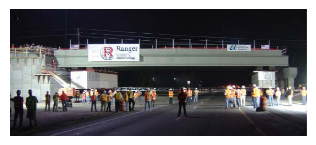
Fig. 4 Installation of Graves Avenue Span over I-4 West, Florida

On June 3, a Saturday night, both directions of I-4 were closed shortly before midnight. In about half an hour the SPMTs carried the span along I-4 to the bridge site, straddling both directions of I-4 before moving over to the I-4 West lanes for the installation. Proper alignment of the beams onto the bearing seats took approximately 2 hours.