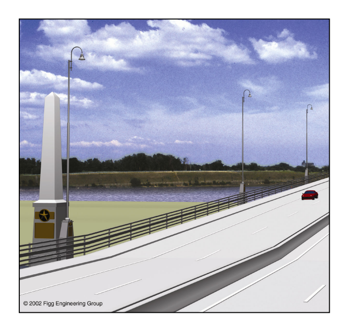
Fig. 4 Commemorative Monument Design