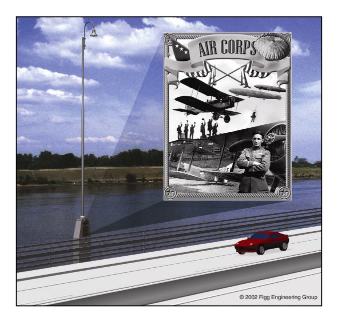
Fig. 3 Commemorative Plaque Design

The light poles required every 150' will be supported on concrete pilasters, which include bronze plaques that commemorate various branches of the armed services from World War I (see Figure 3). These will form a linear library along the sidewalk so that pedestrians can view, learn and honor the war heroes. Four memorial obelisks (see Figure 4) will be erected at the bridge abutments; two of these will incorporate original bronze plaques from the existing bridge and the other two will have new bronze plaques that rededicate the bridge to the World War I veterans.