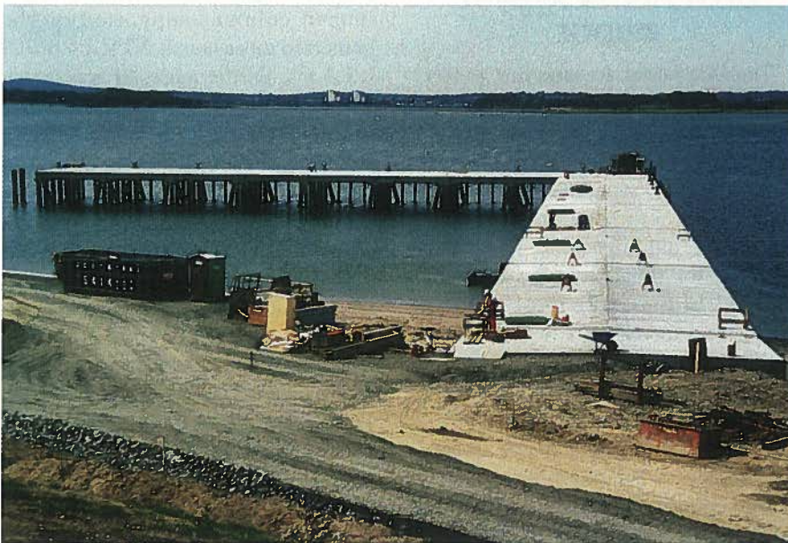
Fig. 3. The all-precast concrete Spectacle Island Pier, Boston, Massachusetts.

As shown in Fig. 4, cast-in-place pier caps are supported by 14 in. (0.36 m) square prestressed concrete piles with an 80-ton capacity in compression and a 40-ton capacity in tension (for barge impact forces). The caps are made composite with the precast, prestressed concrete double-T superstructure, which has a 4 in. (100 mm) cast-in-place mesh reinforced topping. The beams are integral with the caps so as to raise the caps as far above high tide as possible.