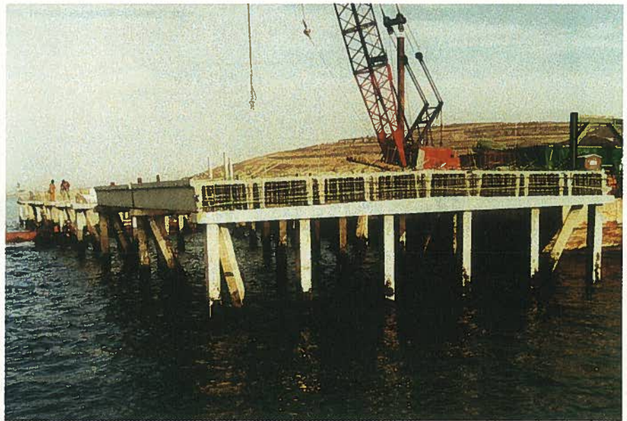
Fig. 4. View of the precast, prestressed concrete double-T superstructure of the Spectacle Island Pier, Boston, Massachusetts.

Client: Massachusetts Turnpike Authority, Boston, Massachusetts Management Consultant: