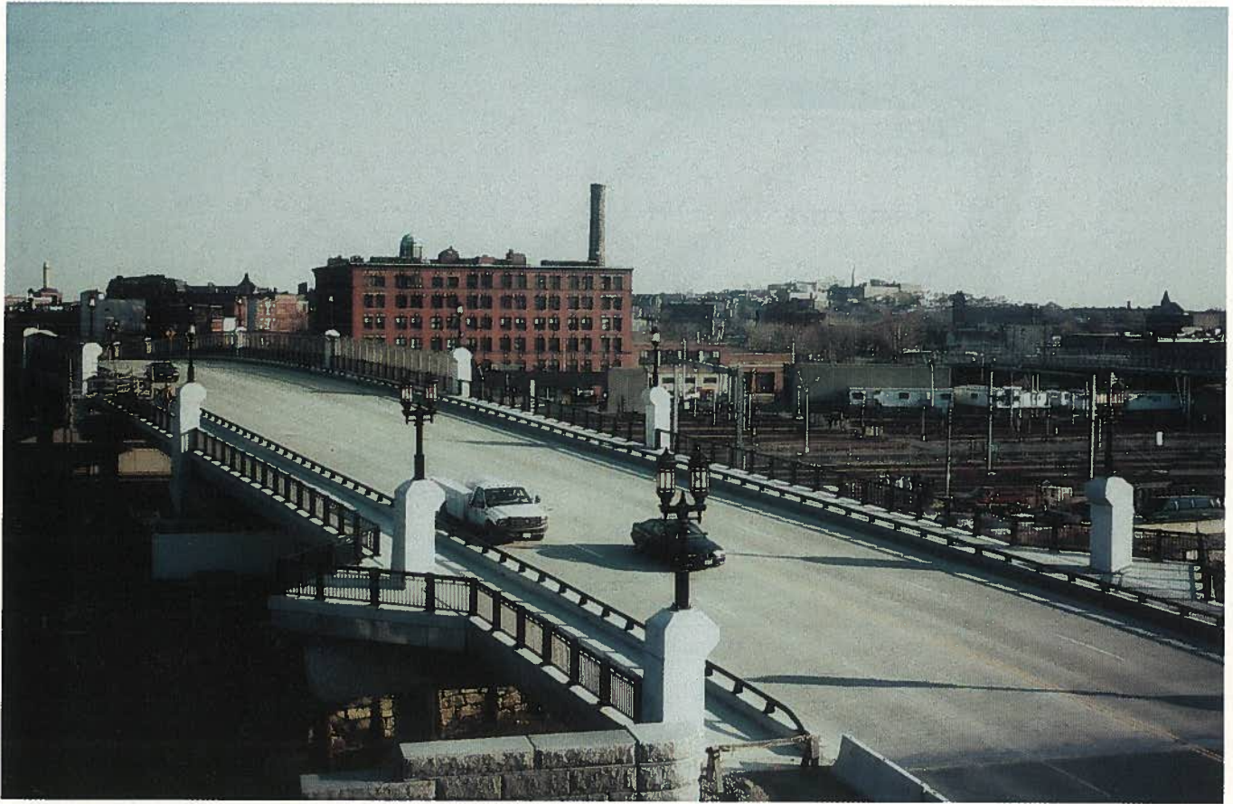
Fig. 1. Completed view of the Broadway Bridge, Boston, Massachusetts.

concrete bents supported on 14 in. (0.36 m) square precast, prestressed concrete piles, except for certain supports founded on 3 and 4 ft (0.9 and 1.2 m) diameter drilled shafts where space limitations prohibited the use of driven piles with a typical footing.